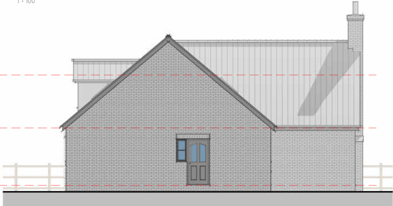
Elevation 04 - Left