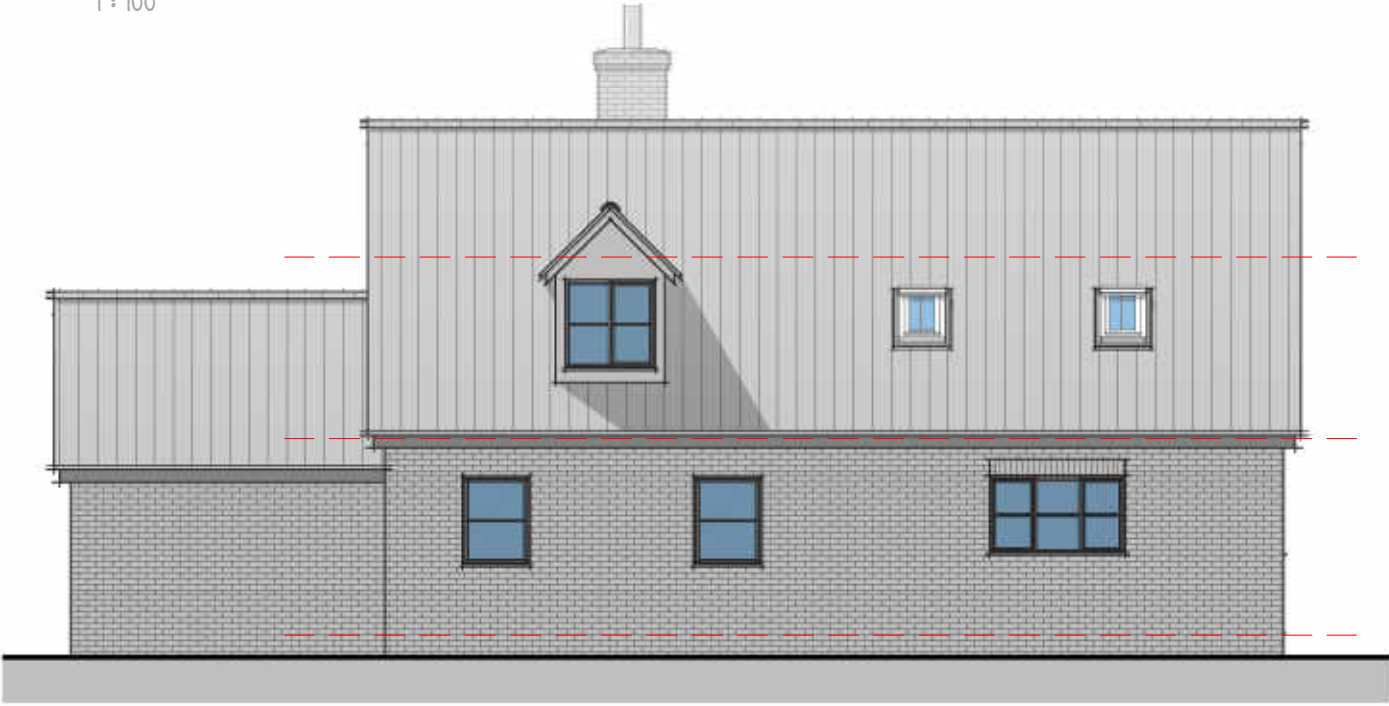
Elevation 03 - Rear