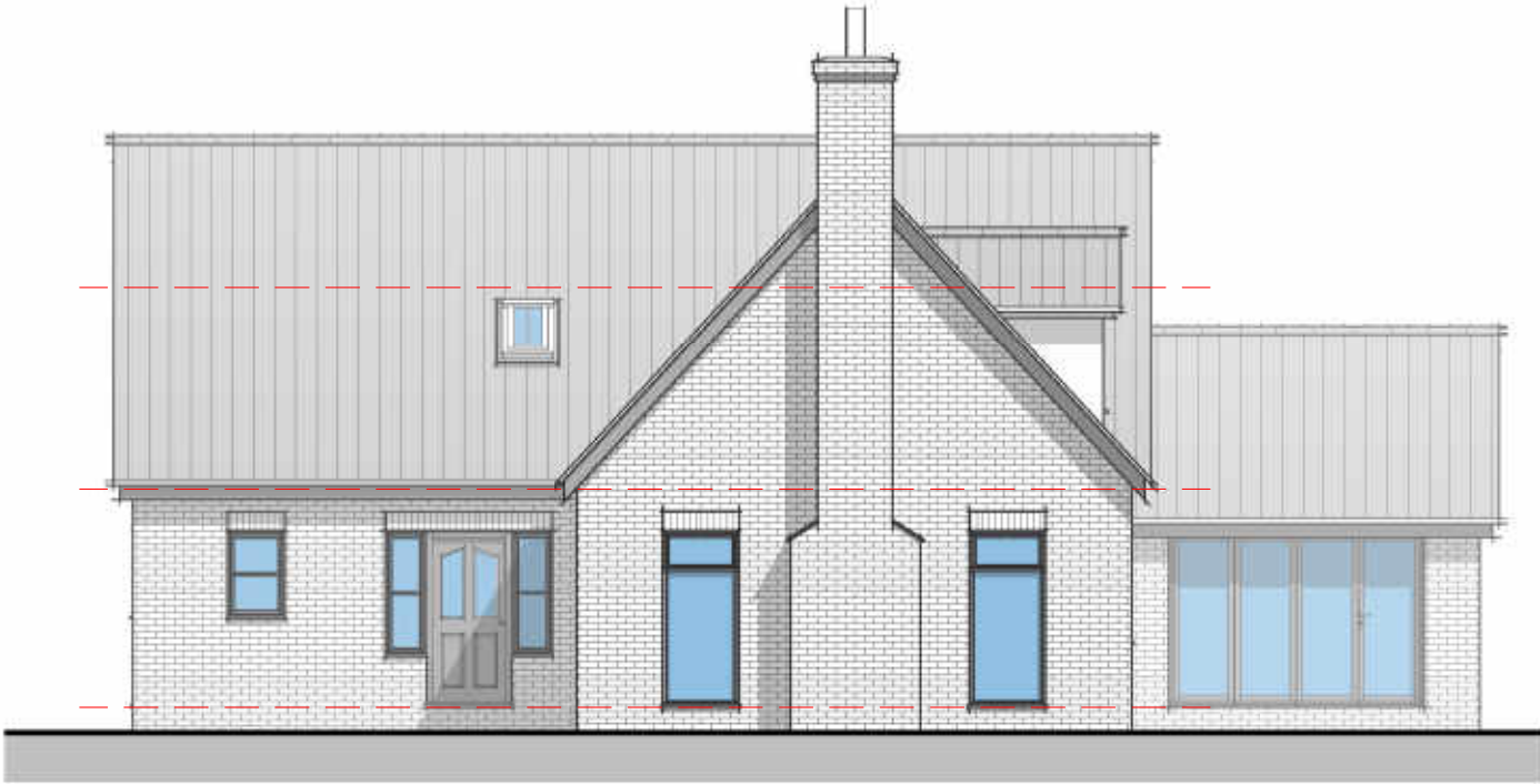
Elevation 01 - Front