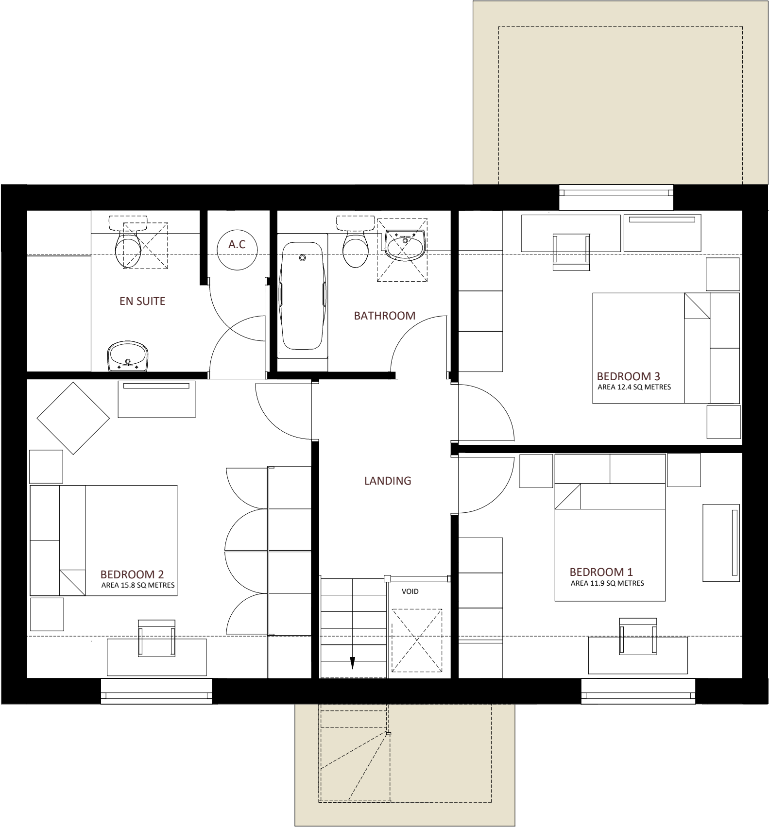
FIRST FLOOR PLAN AREA 62.00 SQ METRES