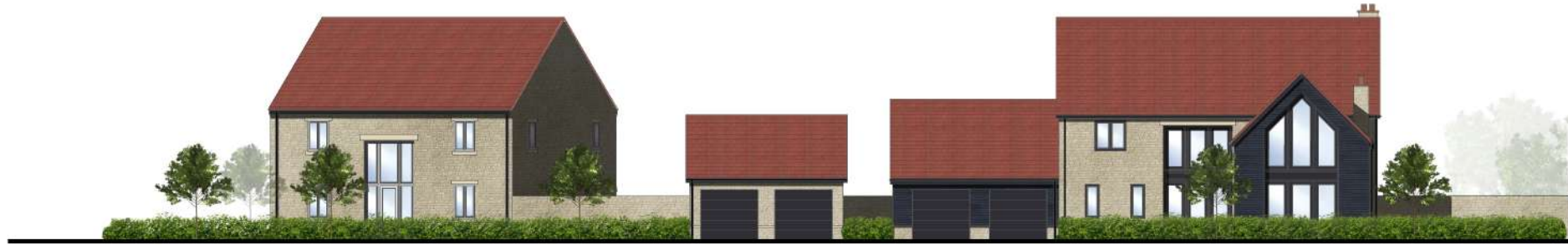
C - C