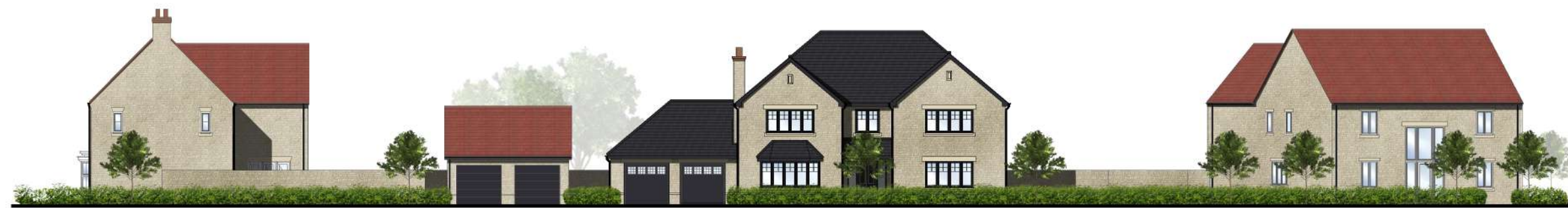
D - D