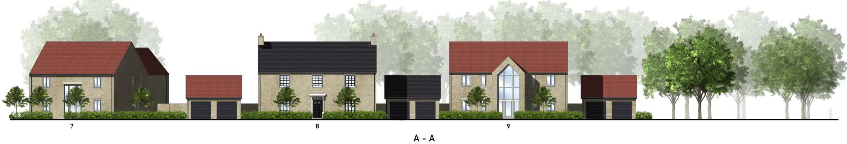
A - A