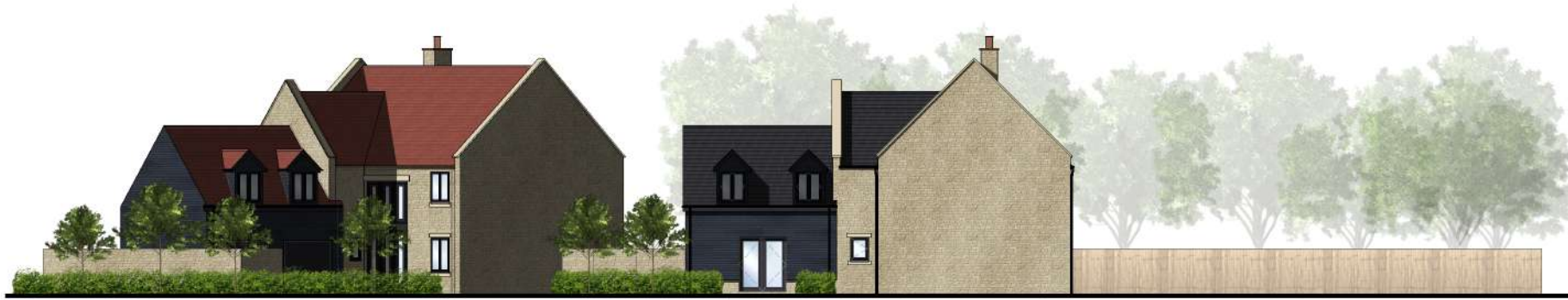
B - B