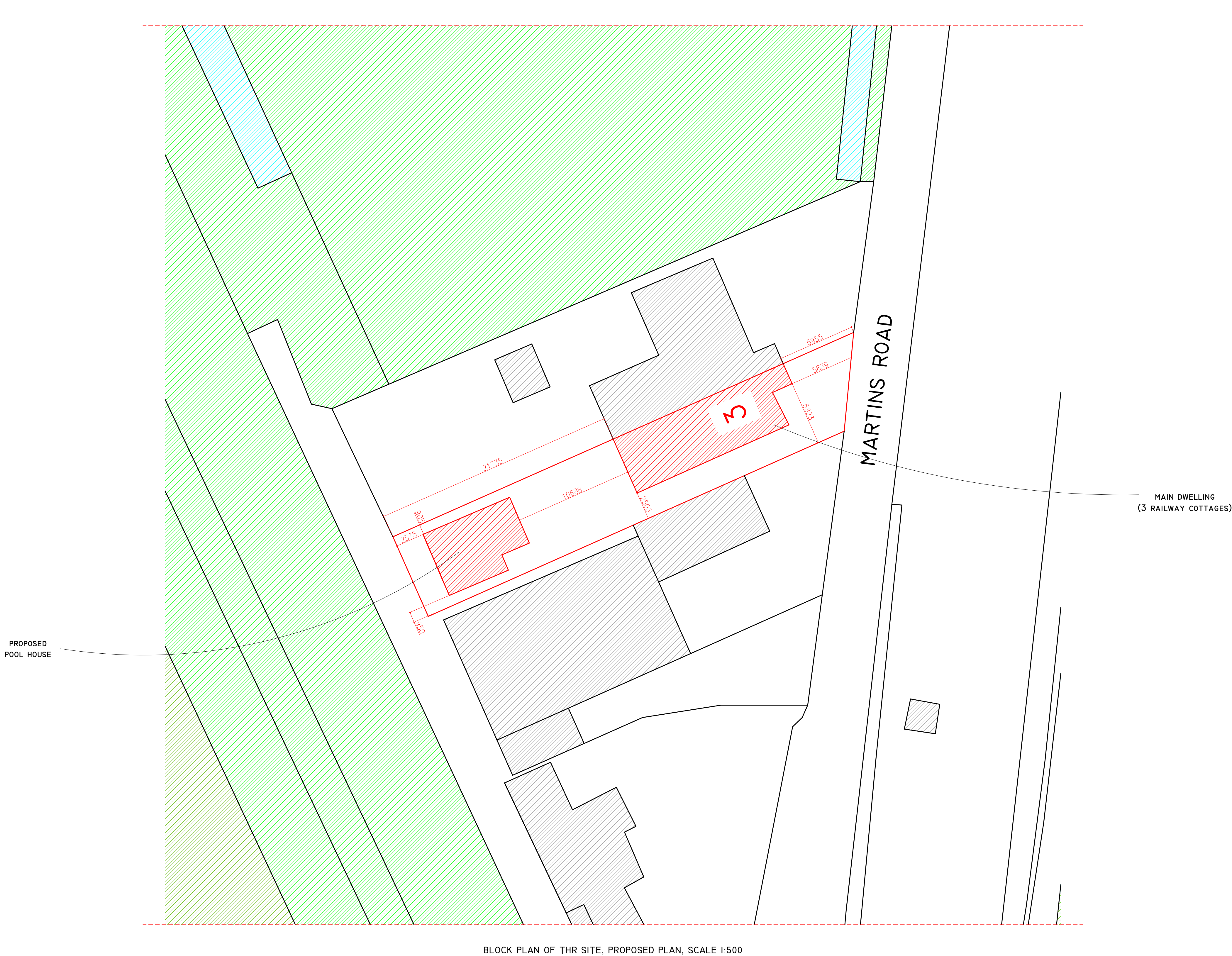
BLOCK PLAN OF THR SITE, PROPOSED PLAN, SCALE 1:500