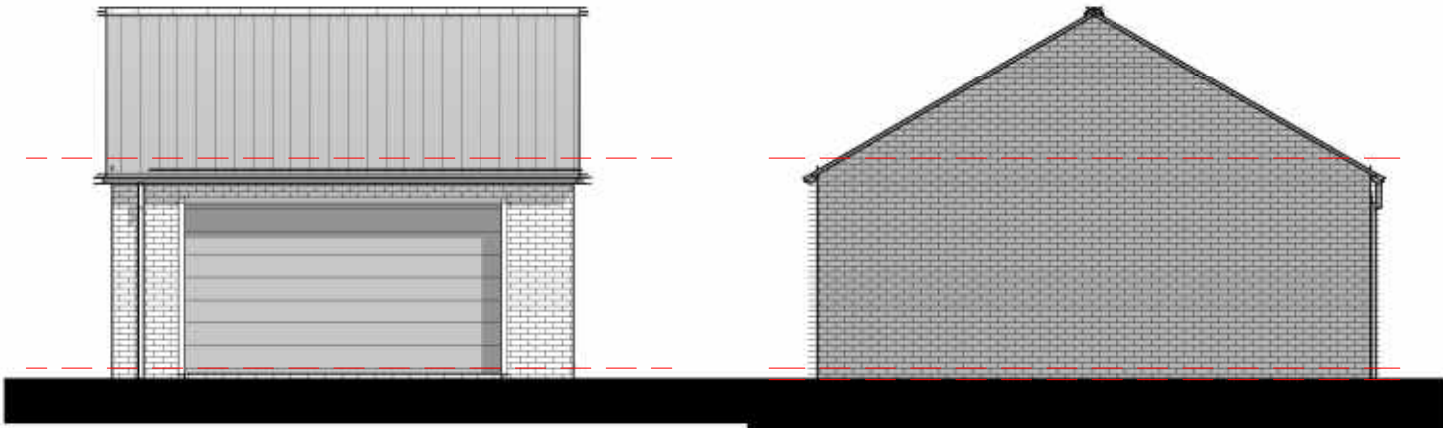
Elevation 01 - Front 1 : 100