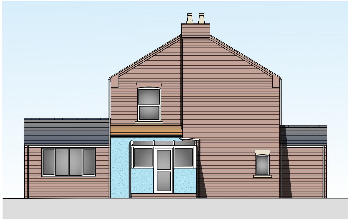
Proposed Side (NE) Elevation Scale 1:100