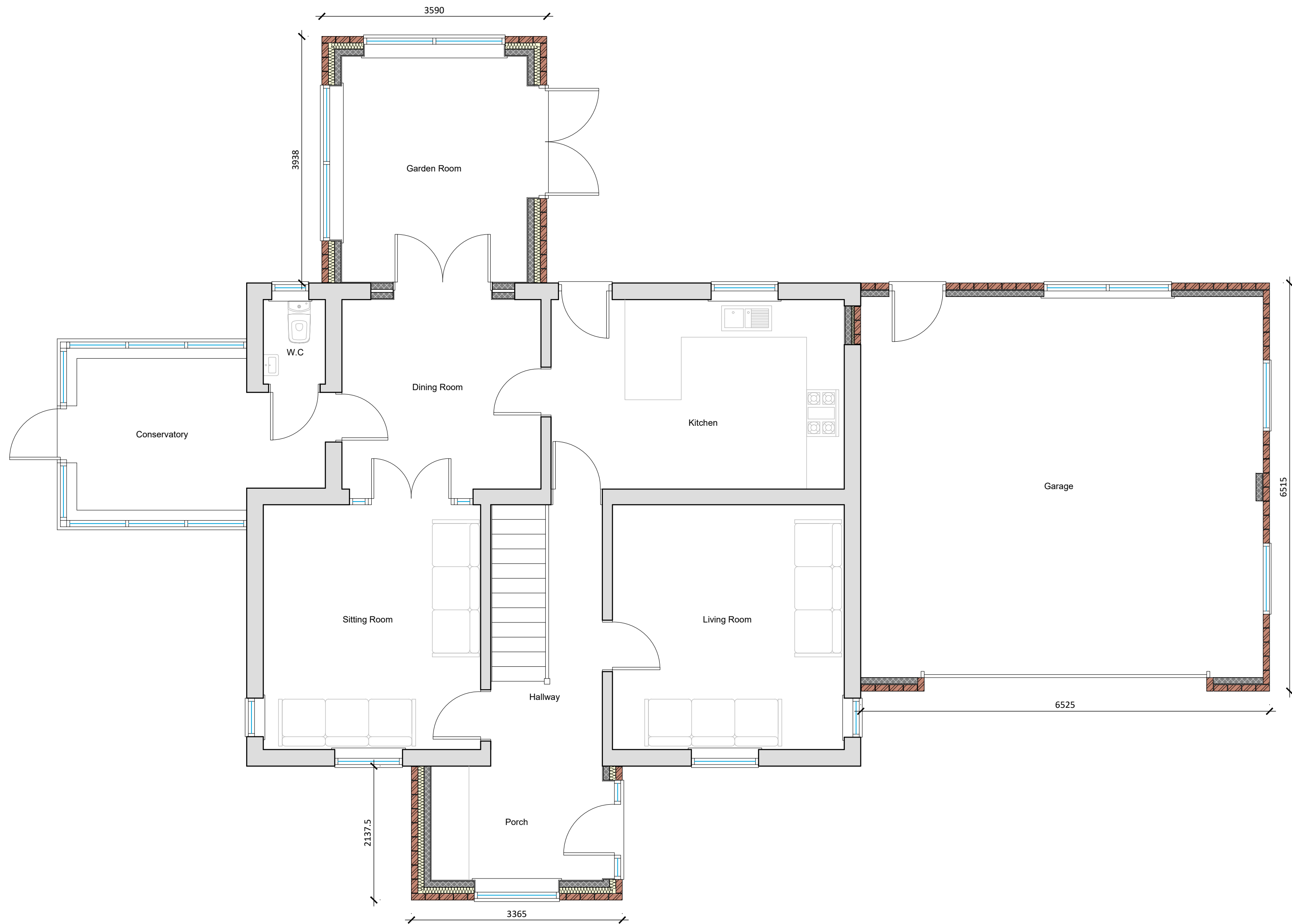
Proposed Ground Floor Plan Scale 1:50