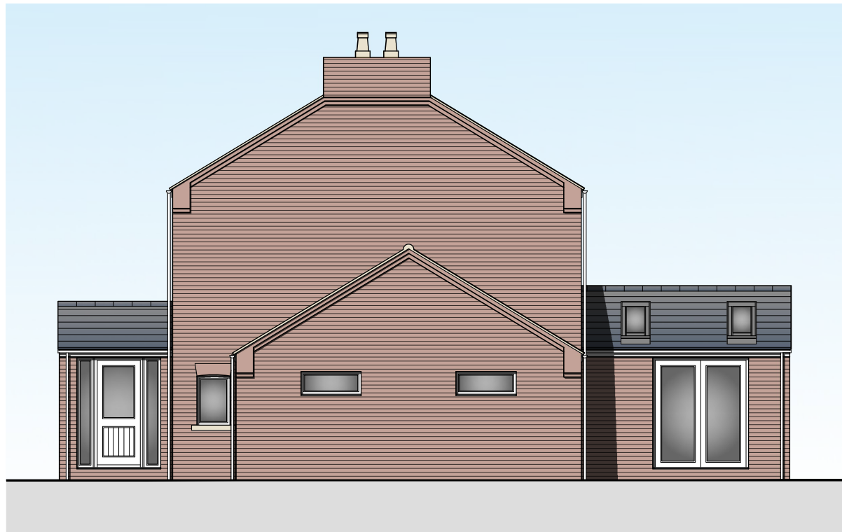
Proposed Side (SW) Elevation Scale 1:100