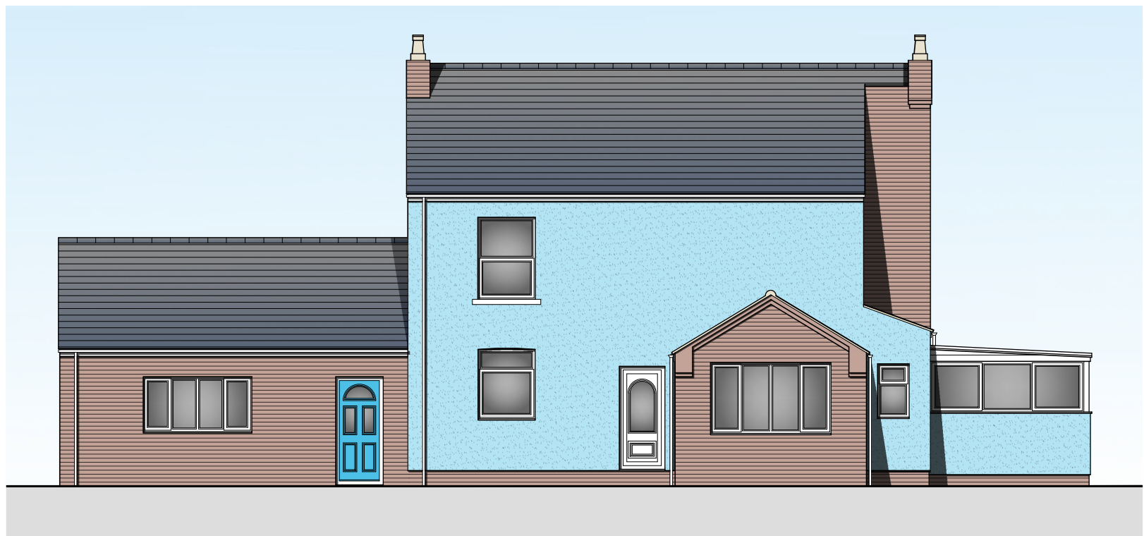
Proposed Rear (SE) Elevation Scale 1:100