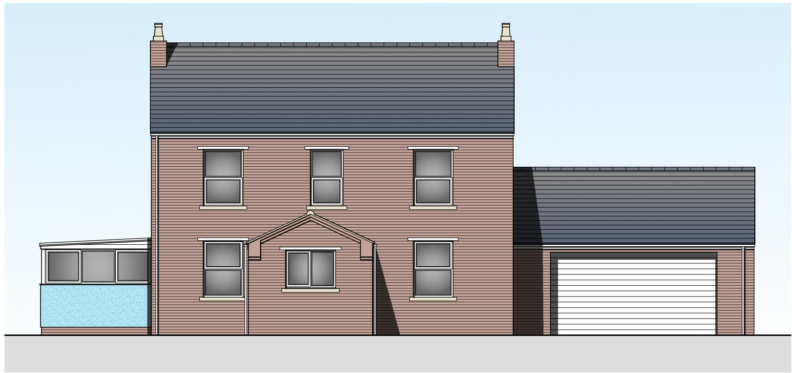
Proposed Front (NW) Elevation Scale 1:100