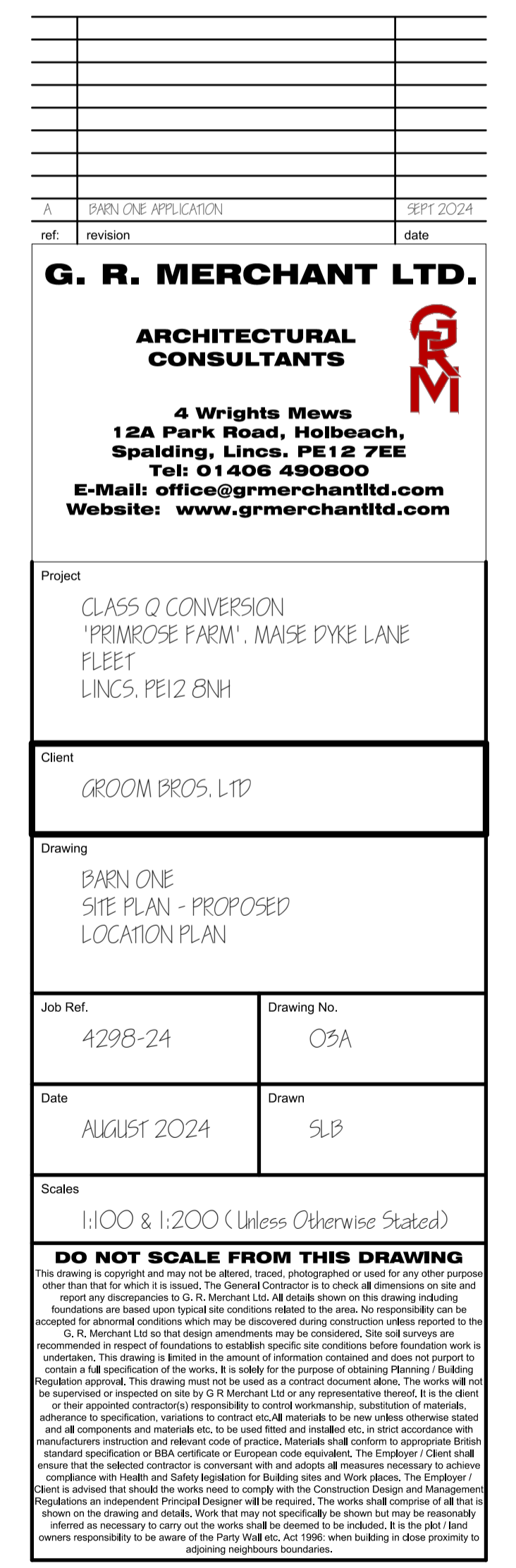
LOCATION PLAN 1:2500

Ordnance Survey (c) Crown Copyright 2024. All rights reserved. Licence number 100022432