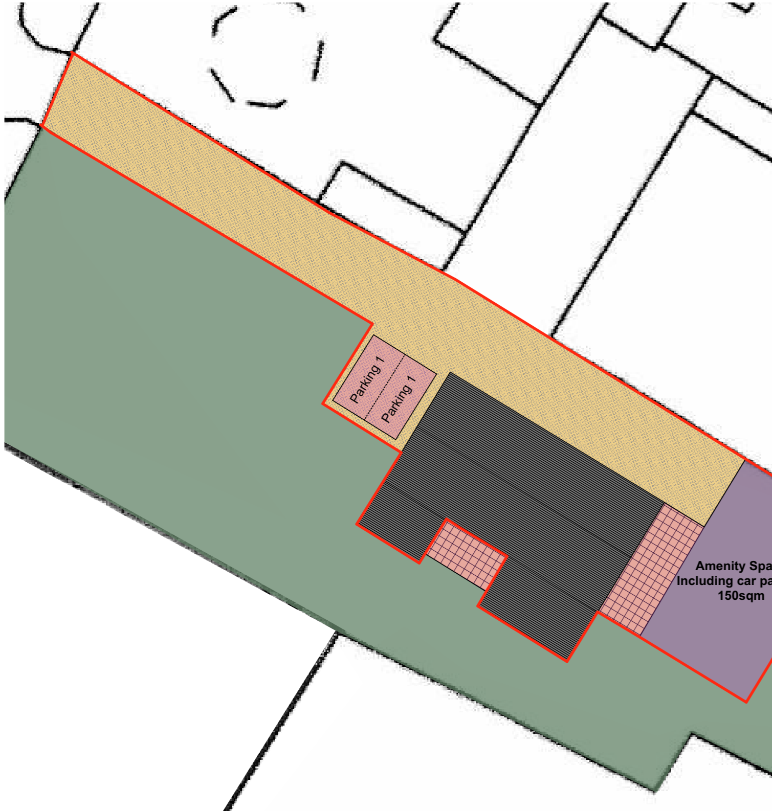
Block Plan, 1:250@A3