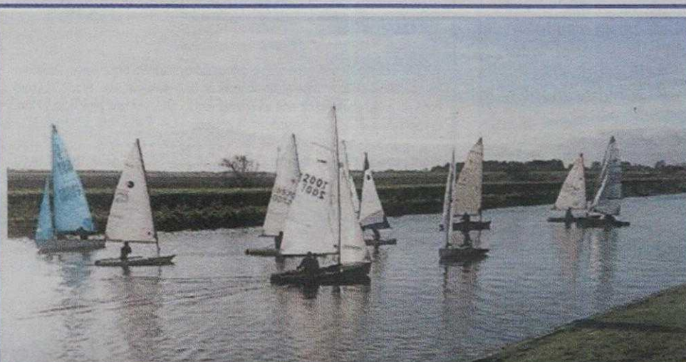
SETTING SAIL: The starting line for round three of the Frostbite Series on Sunday.

Results: KO Cup - Swan Moulton 6 Mail Cart 1; Riverside C 4 Riverside D 3; Riverside B 7 Drayman's C 0; Services B 3 Consti 4.