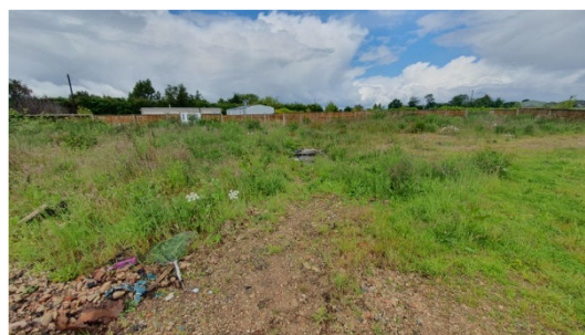
Photograph 4. Eastern plot of the three.