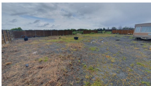
Photograph 3. Central of the three plots.