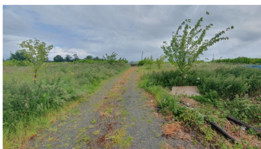
Photograph 1. Gravel track and modified grassland at northern entrance to the Site.