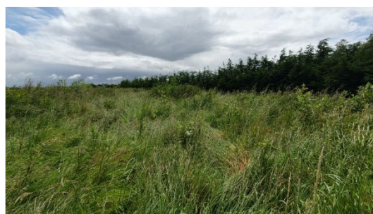
Photograph 2. Typical composition of modified grassland in the south of the Site.