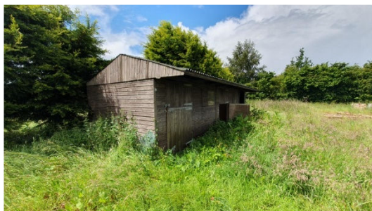
Photograph 5. Western most of the three stable blocks.

(Photographs 5 and 6). There are no wall cavities or roof spaces. Ambient light levels were high due to the open stable doors. No evidence of use by bats was recorded in the stables.