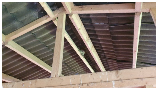
Photograph 6. Typical Internal view of the roof (with old swallow nests).