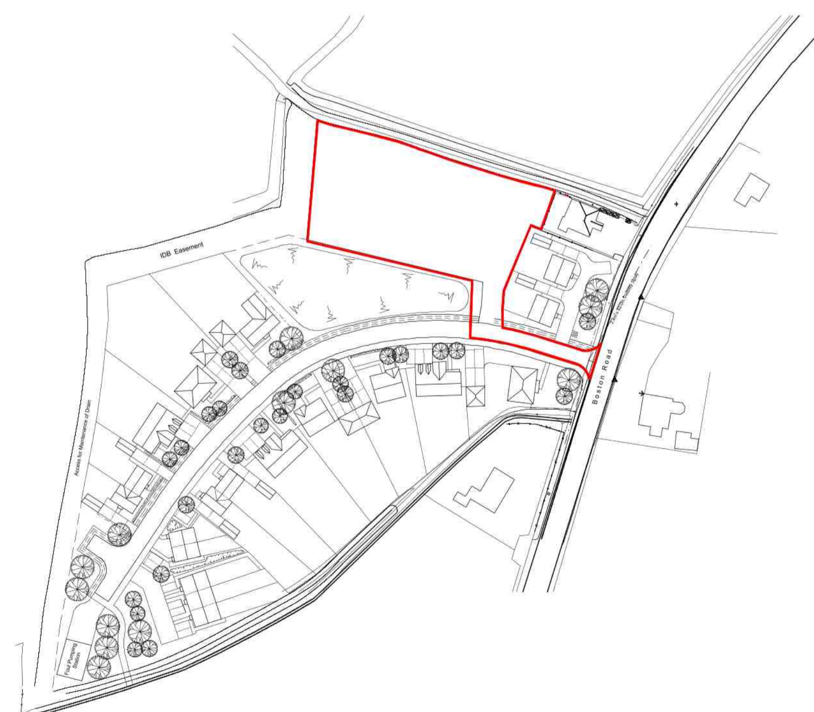
EXISTING LOCATION PLAN scale 1:1250