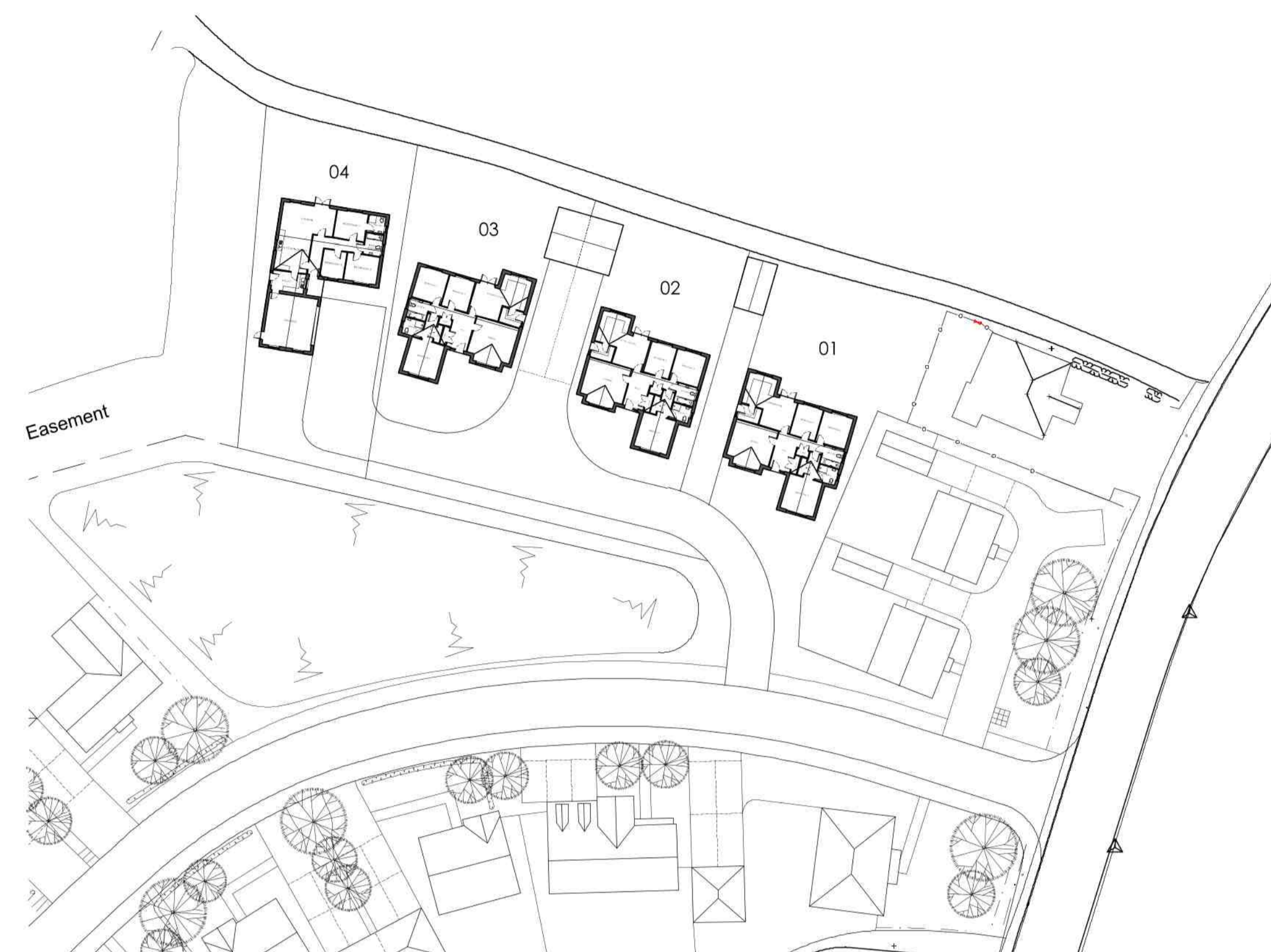
PROPOSED SITE PLAN scale 1:500