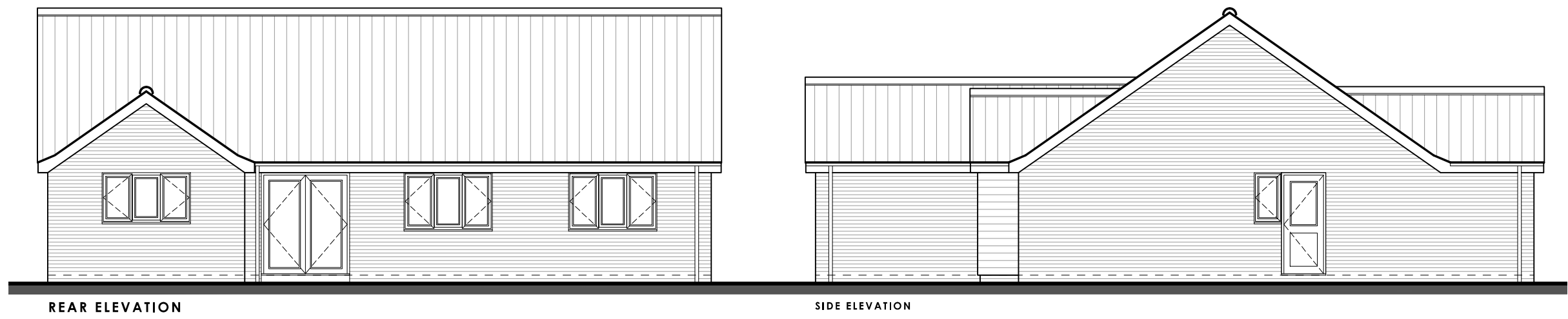
PROPOSED ELEVATIONS scale 1:100