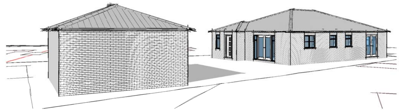
3D View 2