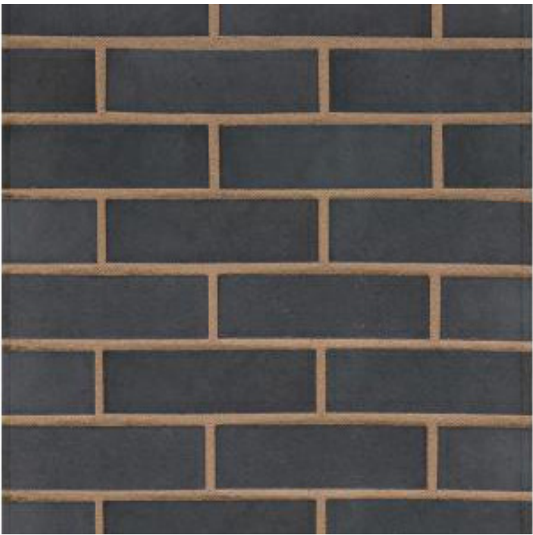
Dark Grey Engineering bricks up to DPC