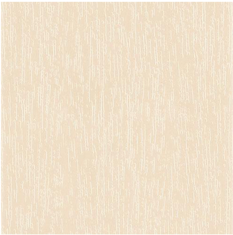
All Window Frames - Cream