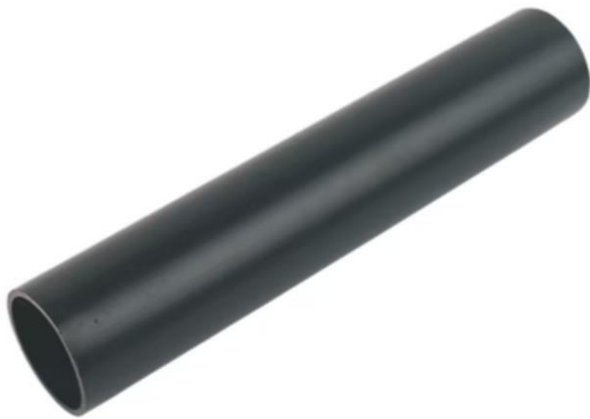
All Fascias, Soffits and Guttering - Black