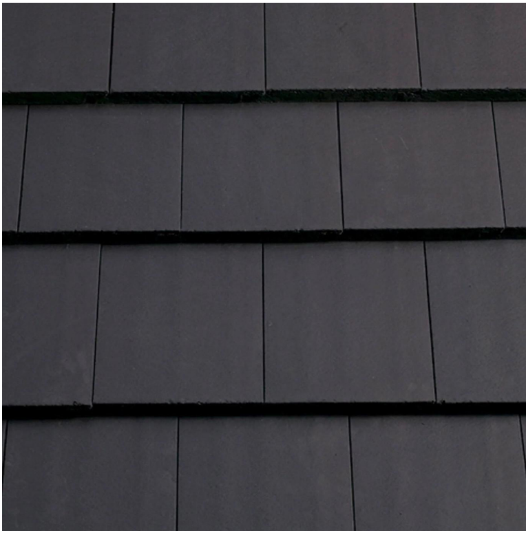
All Roof Tiles- Sandtoft Calderdale Edge