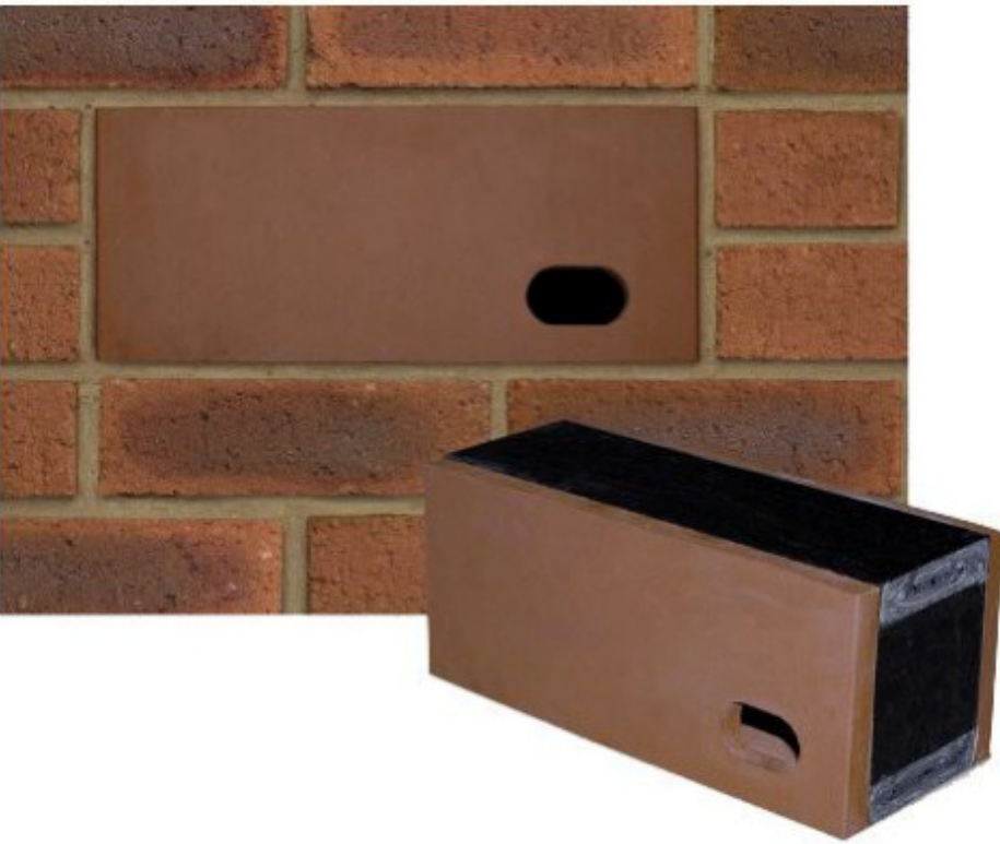
Swift bricks to the gable of the properties or within the eaves - Ibstock Swift Eco Habitat or equivalent.