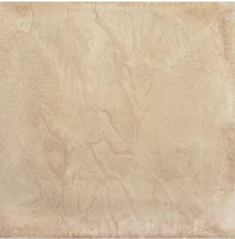
Bradstone Peak Riven Utility Paving - Buff