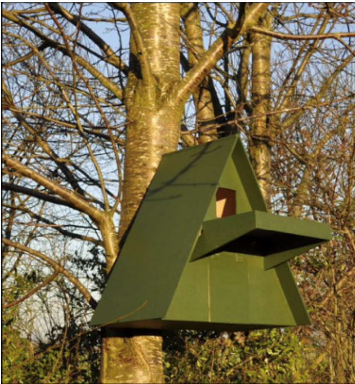
Barn Owl Roosting Box facing an open aspect away from prevailing wind, between 4-6m high