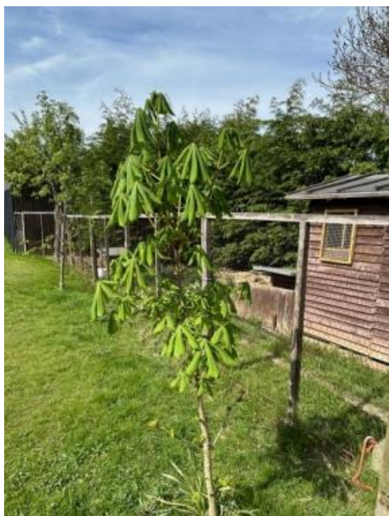
Photograph 12: Tree planted along northern side of the site