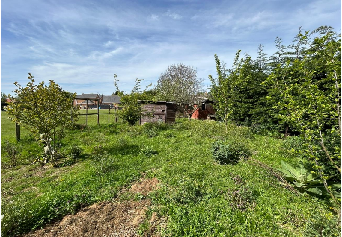
Photograph 5: Further view of the orchard area