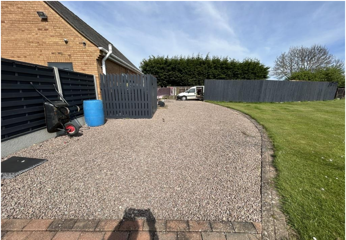
Photograph 7: Gravel access/driveway