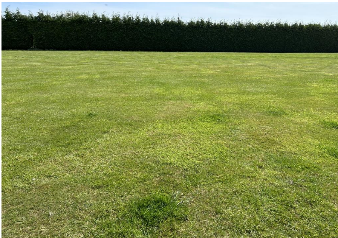
Photograph 1: Grassland area (g4)