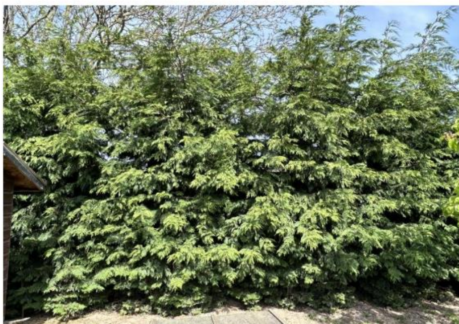
Photograph 10: Non-native northern boundary