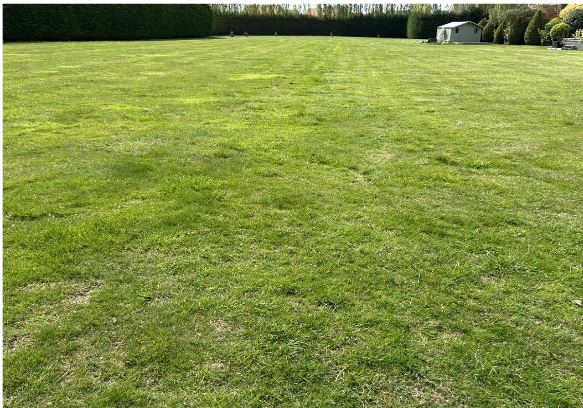
Photograph 2: Further view of the grassland area (g4)