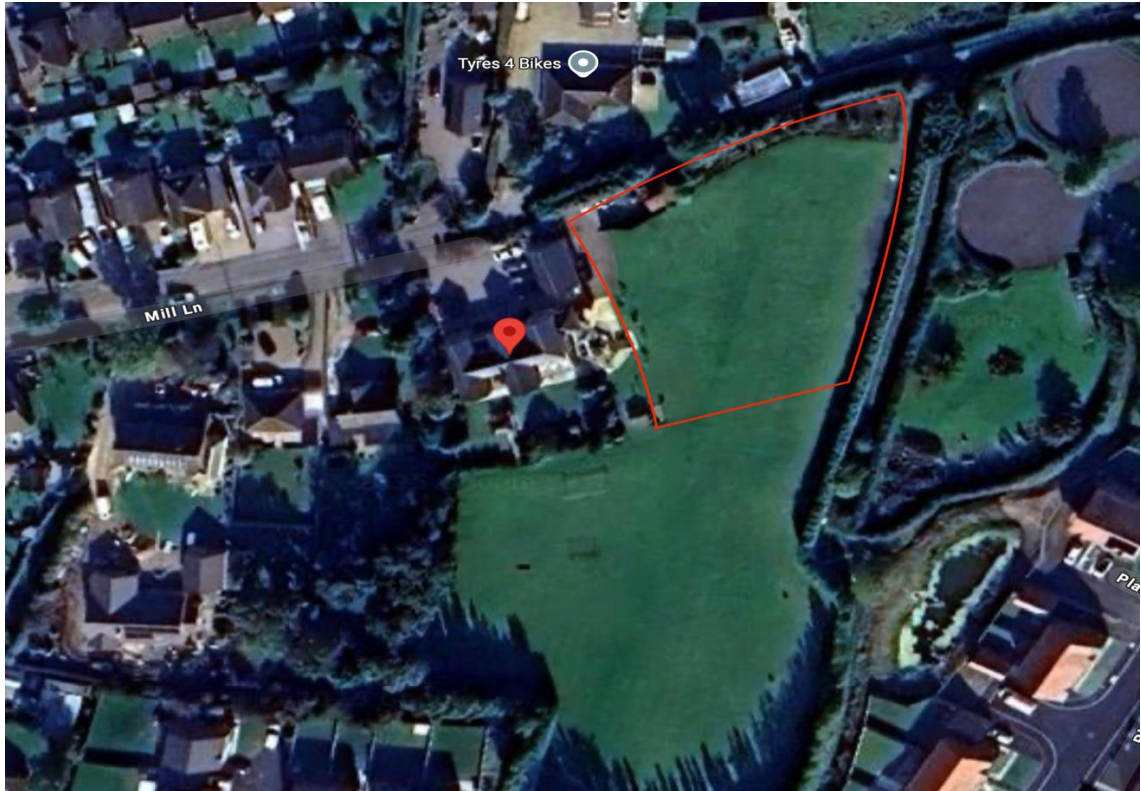
Figure 1: Aerial view of the site