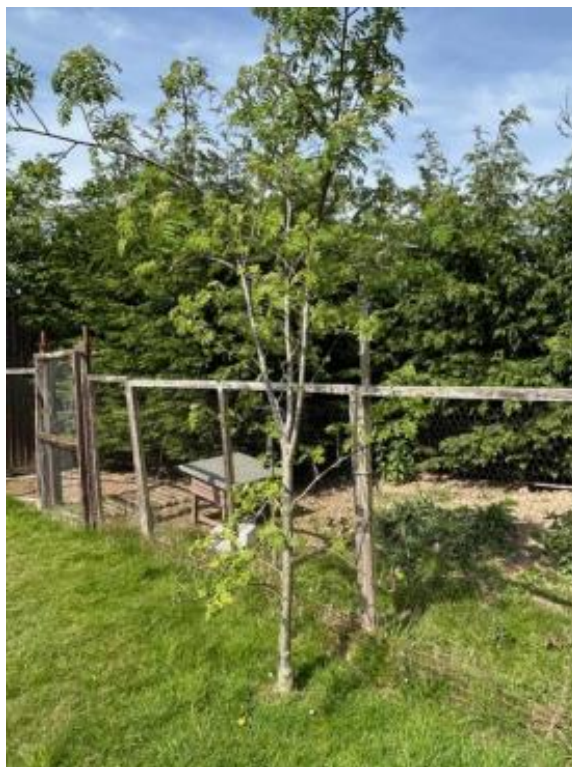
Photograph 11: Tree planted along northern side of the site