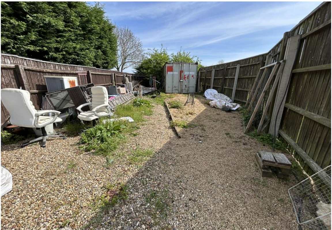
Photograph 8: Gravel storage area and fencing