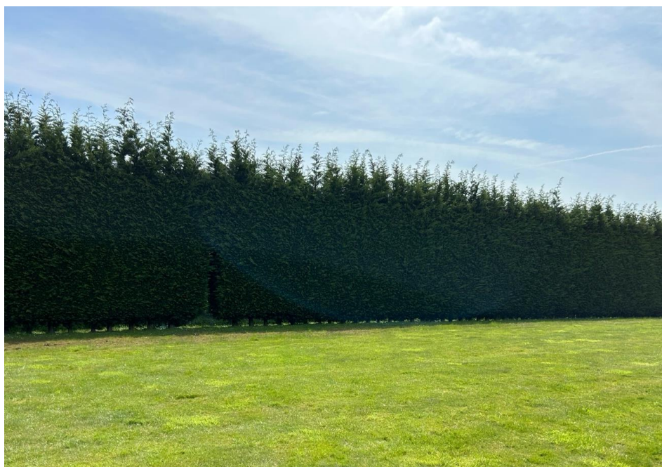
Photograph 9: Non-native eastern boundary hedgerow (h2b)