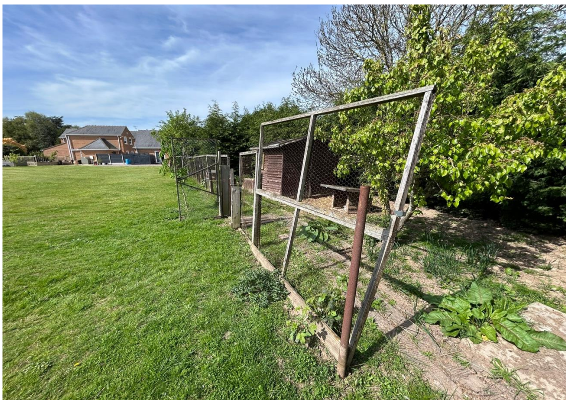
Photograph 4: Fenced area with fruit trees (orchard)