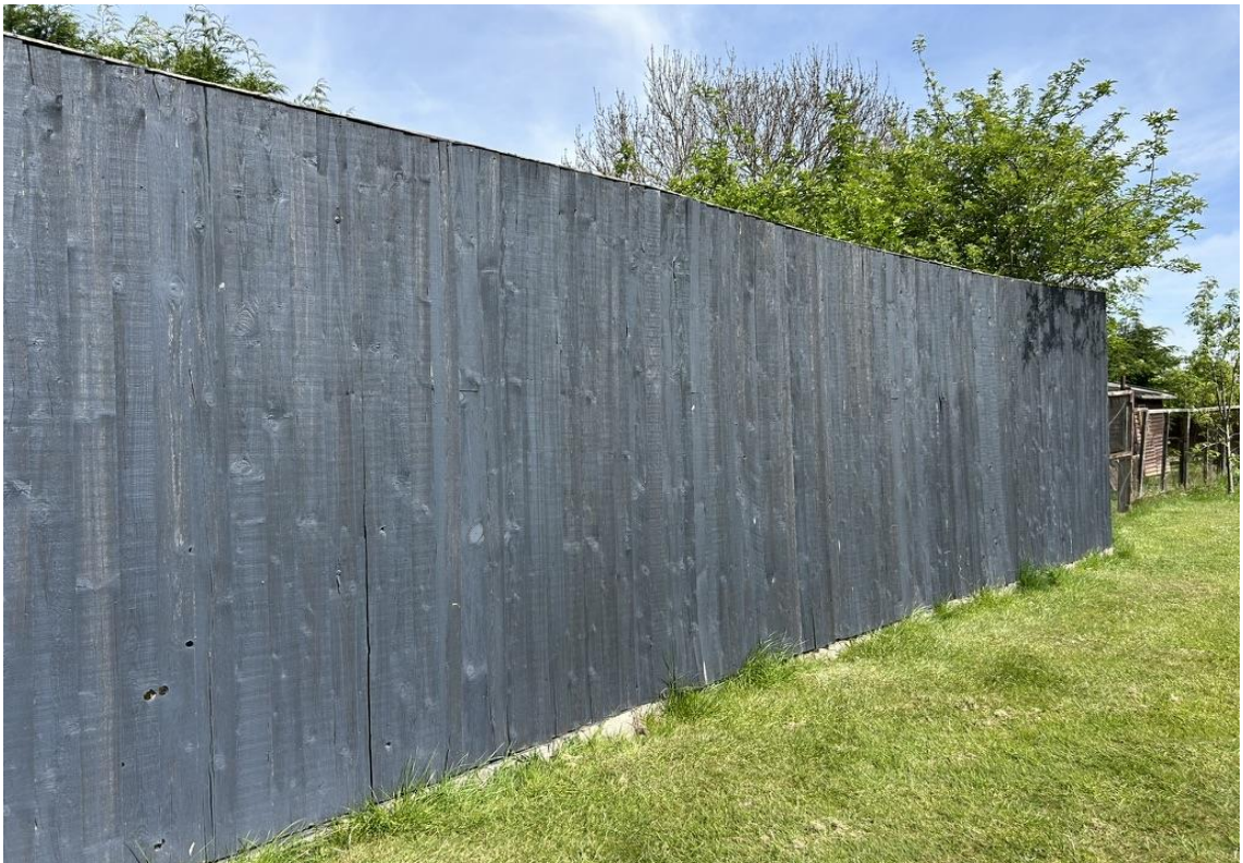
Photograph 6: Internal fence within the northwest corner