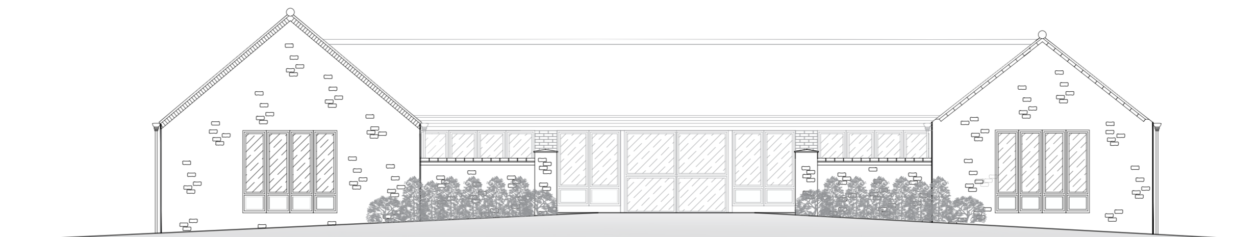
PROPOSED FRONT (SOUTH) ELEVATION