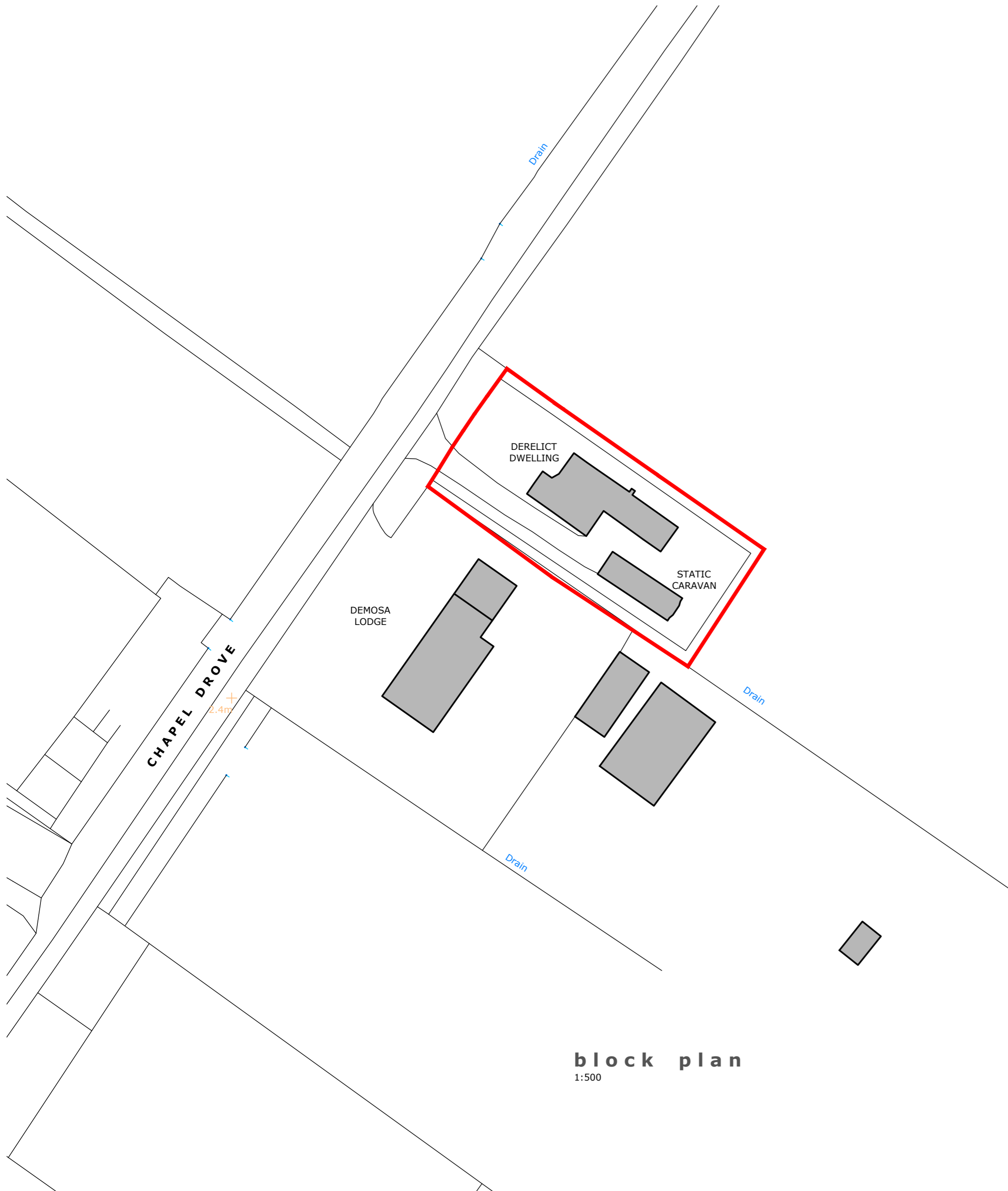
block plan 1:500