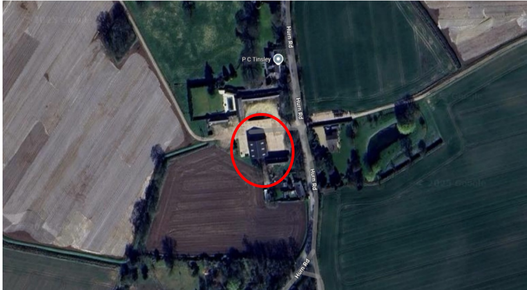
Figure 1: Aerial photograph of the site

The application site is located at Hurn Road, Holbeach Hurn, Spalding. It is located on the western side of the highway. The site is within a rural location, characterised by active agricultural fields.