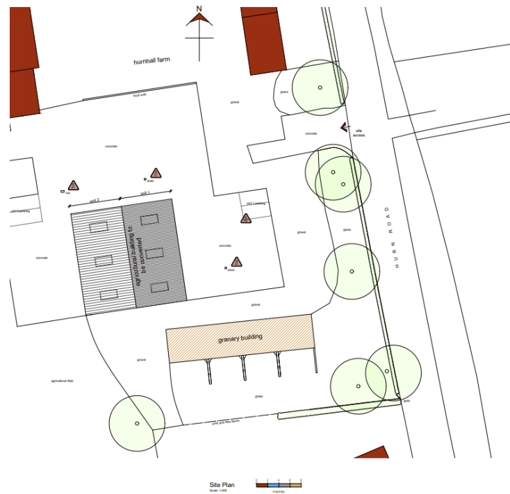
Appendix 2: Proposed site plan