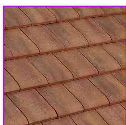
ROOF TILE C: CONDRON CONCRETE SLATE - COUNTRY RED