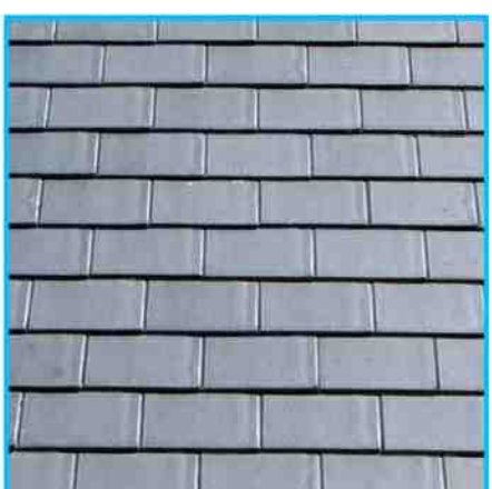
ROOF TILE A: CONDRON CONCRETE SLATE - BLACK