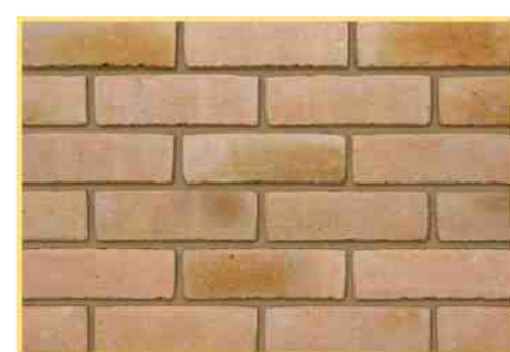
BRICK TYPE A: LEICESTER MULTI CREAM