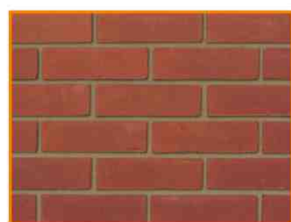
BRICK TYPE B: LEICESTER RED STOCK