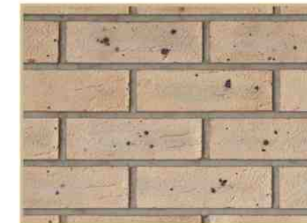
BRICK TYPE D: OAKMOOR CREAM