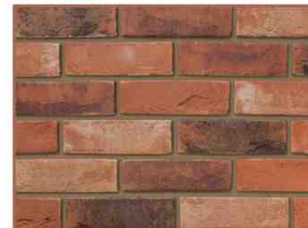
BRICK TYPE C: IVANHOE WESTMINSTER