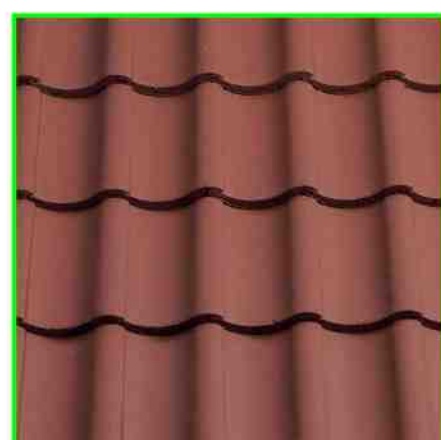
ROOF TILE B: CONDRON CONCRETE PANTILE - TERRACOTTA