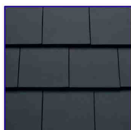
ROOF TILE D: WIENERBERGER NEW CASSIUS ANTIQUÉ SLATE