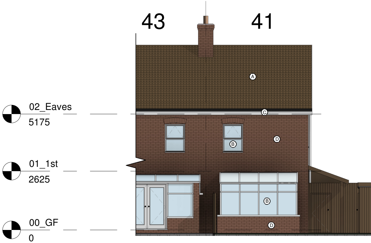
South (Rear) Elevation 1 : 100