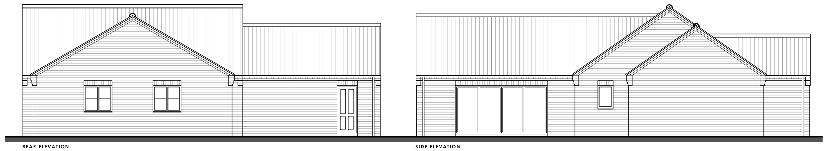
PROPOSED ELEVATIONS scale 1:100