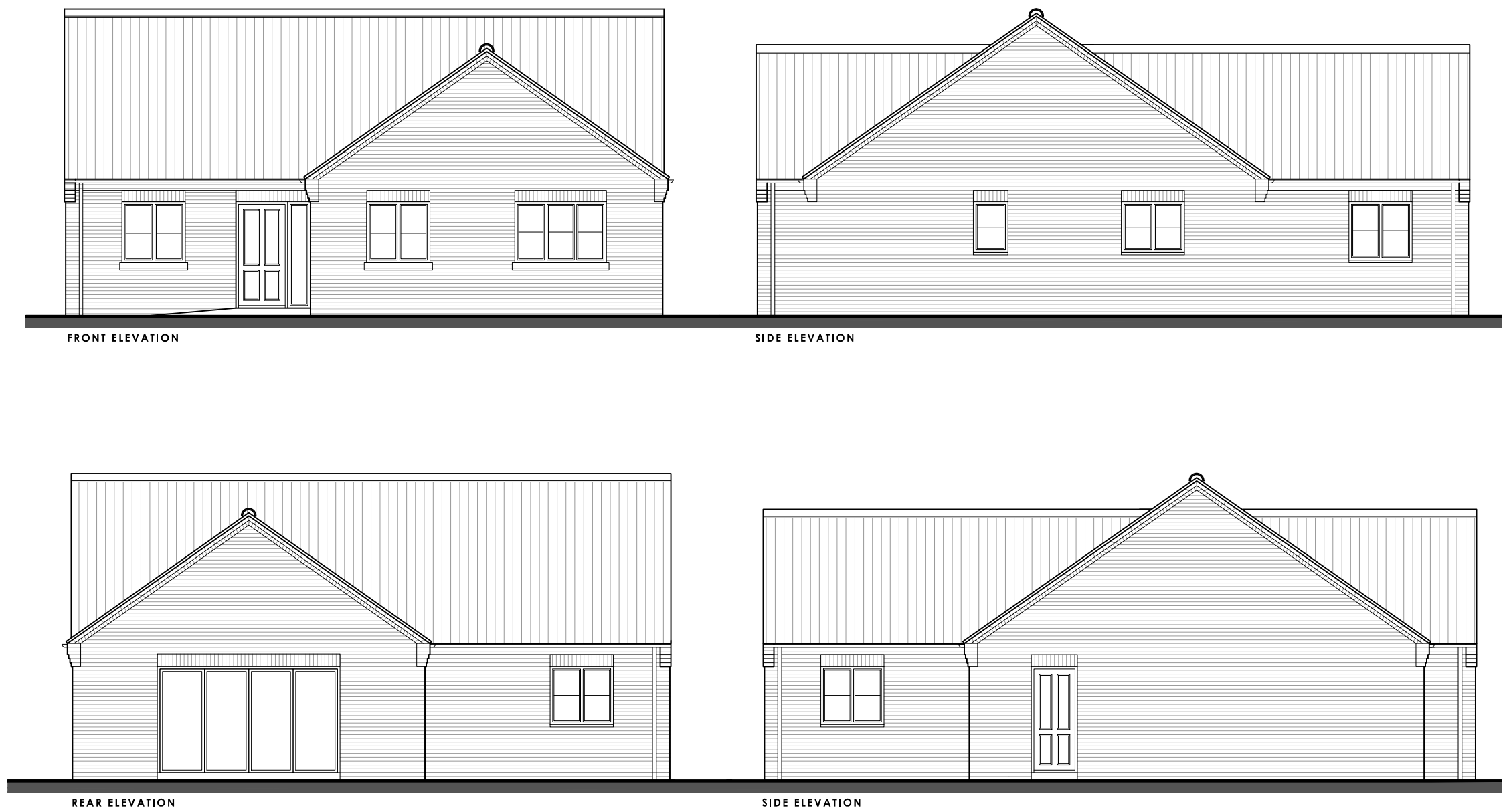
PROPOSED ELEVATIONS scale 1:100