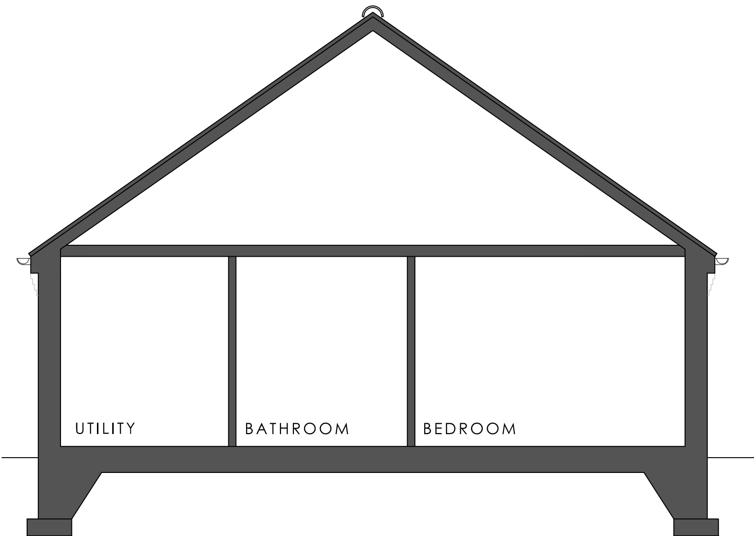
SECTION AA scale 1:50