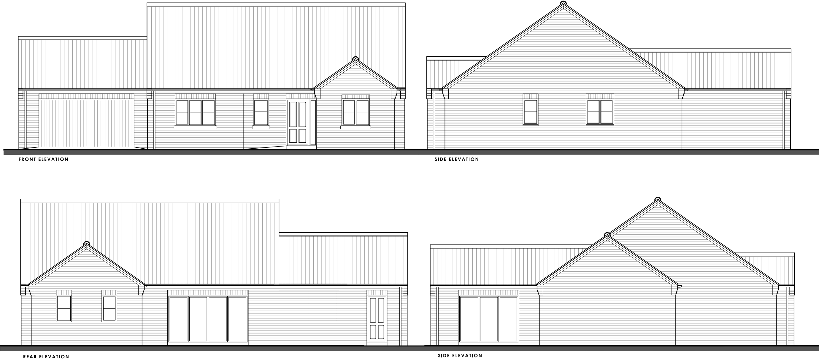
PROPOSED ELEVATIONS scale 1:100