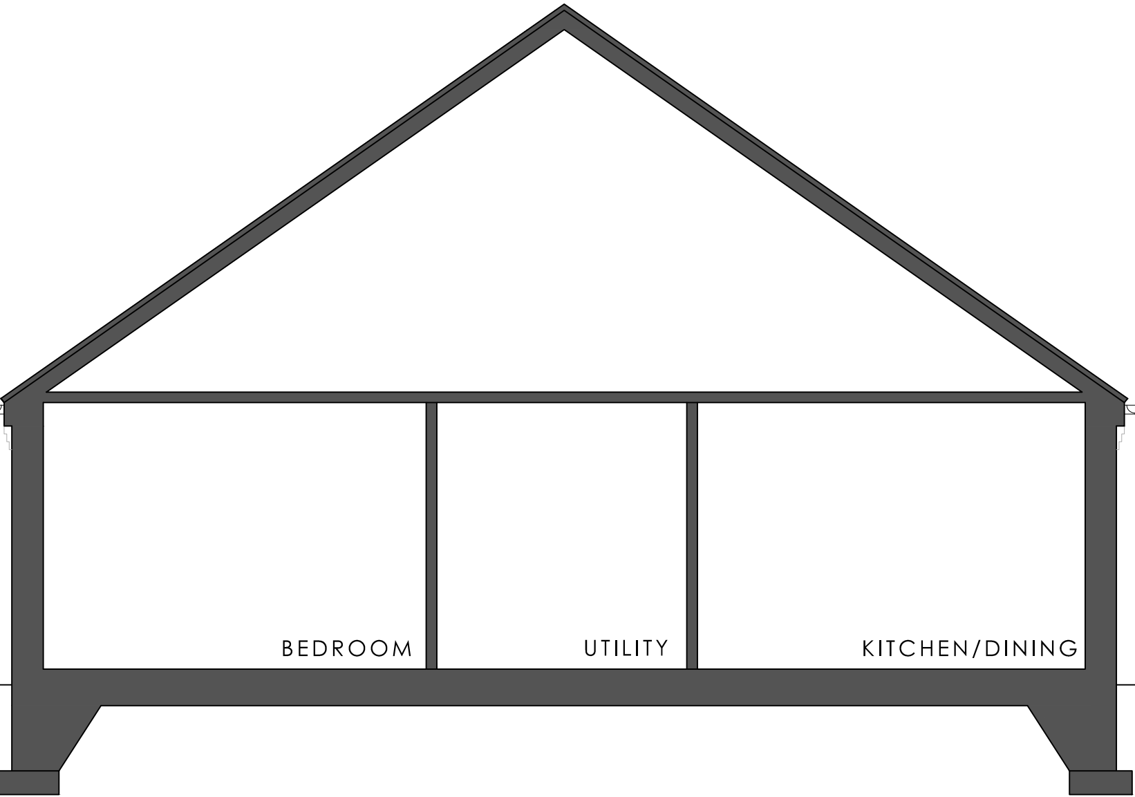
SECTION AA scale 1:50