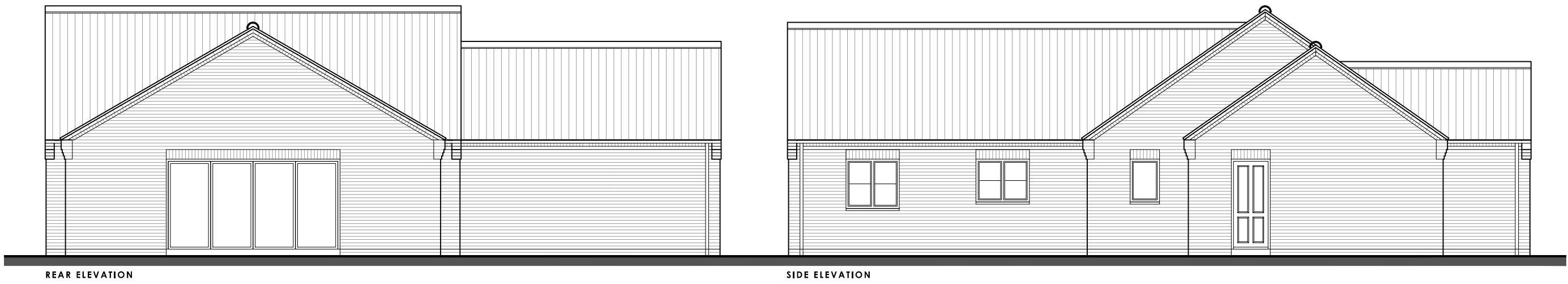
PROPOSED ELEVATIONS scale 1:100