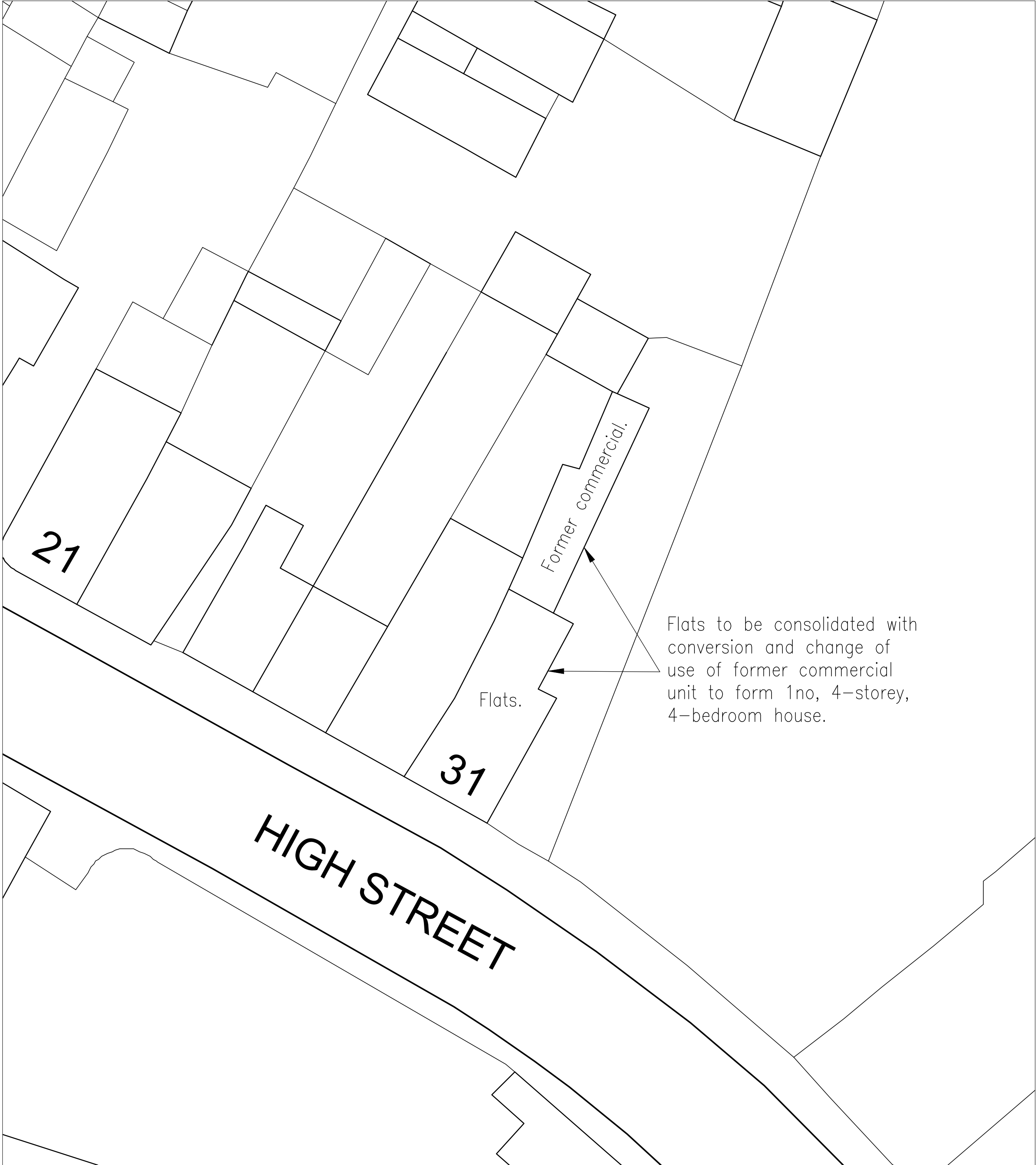
Existing and Proposed Site Plan 1:200