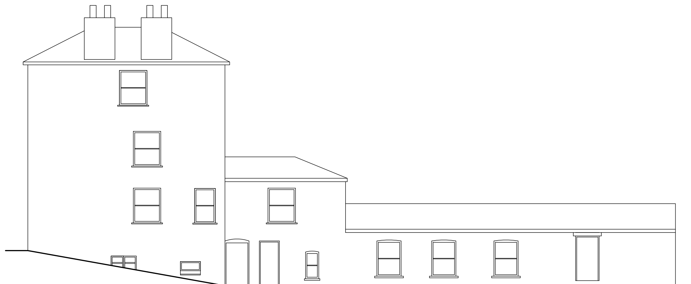
Existing & Proposed Side Elevation 1:100 (Un-changed)