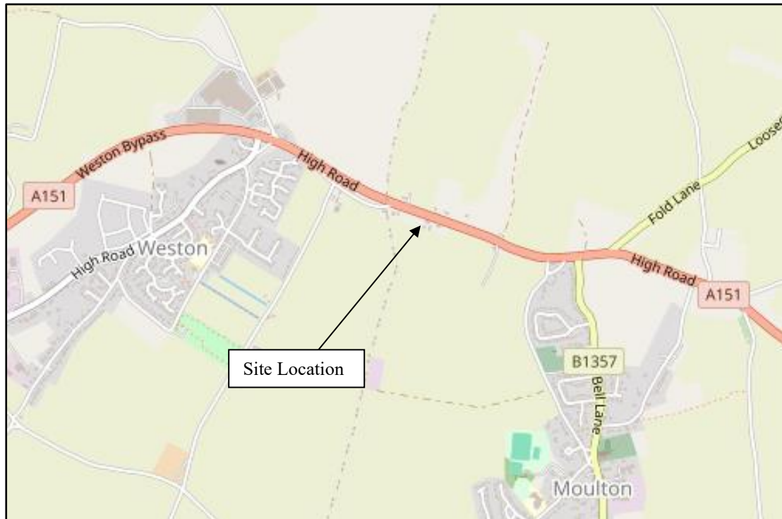
Figure 1 – Location Plan

The location of the site is shown in Figure 1.