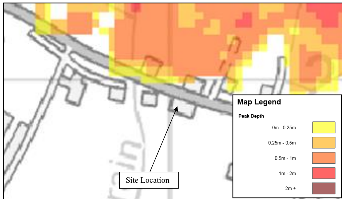
Figure 3 – SFRA 2115 Residual Peak Depth Map during the 1% fluvial and 0.5% tidal Annual Probability Event

The proposed development is a single storey annexe and therefore the finished floor level within these dwellings needs to consider the 0.1% annual probability (1 in 1000 chance each year) event in 2115. The South East Lincolnshire SFRA includes 0.1% annual probability (1 in 1000 chance each year) maps for specific locations, but these do not cover the site.