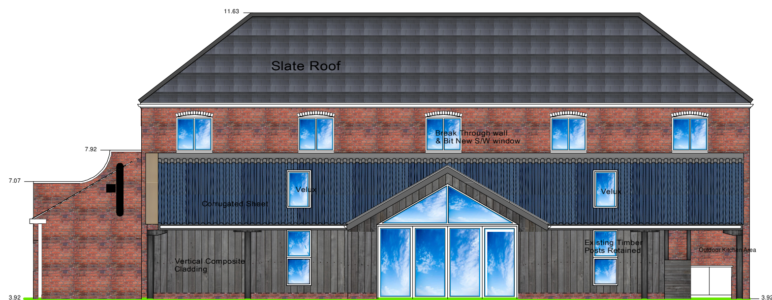
COACH HOUSE NORTH ELEVATION