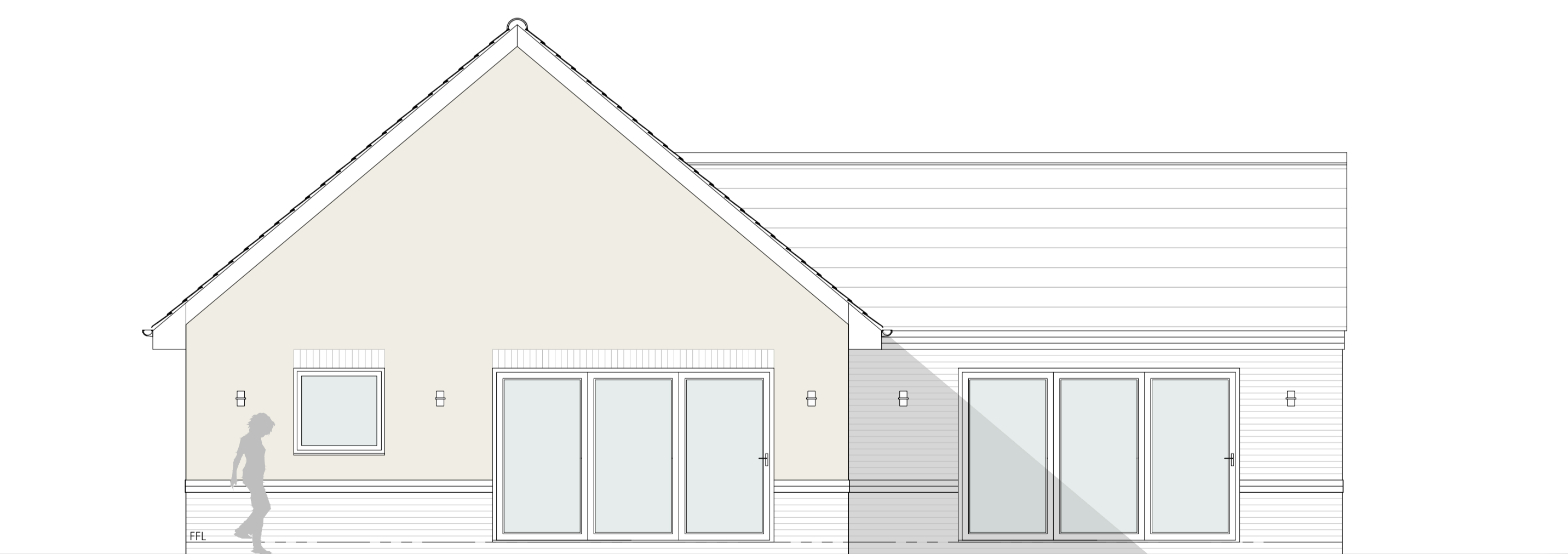
rear elevation (E)

Proposed residential development Land to rear 24 Broad Lane, Moulton, Spalding. for Woodola Group Ltd