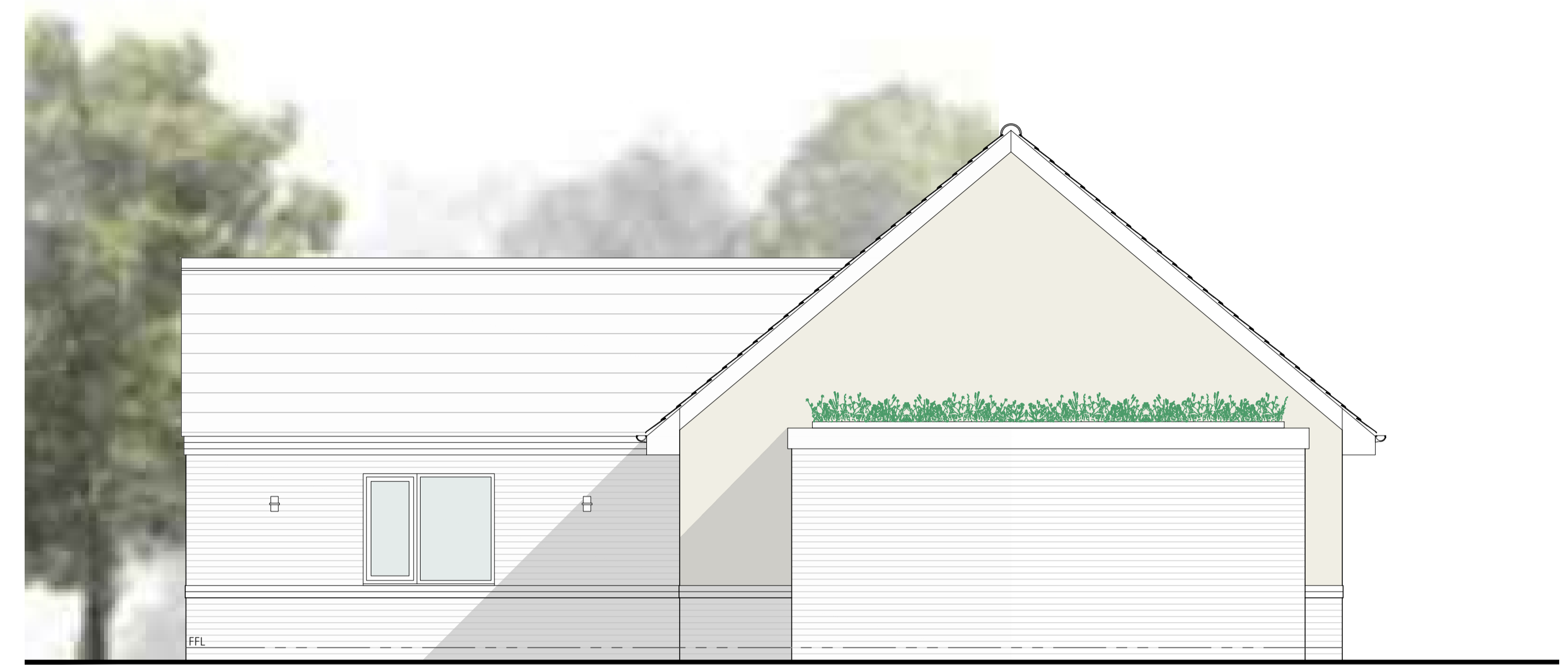
side elevation (W)