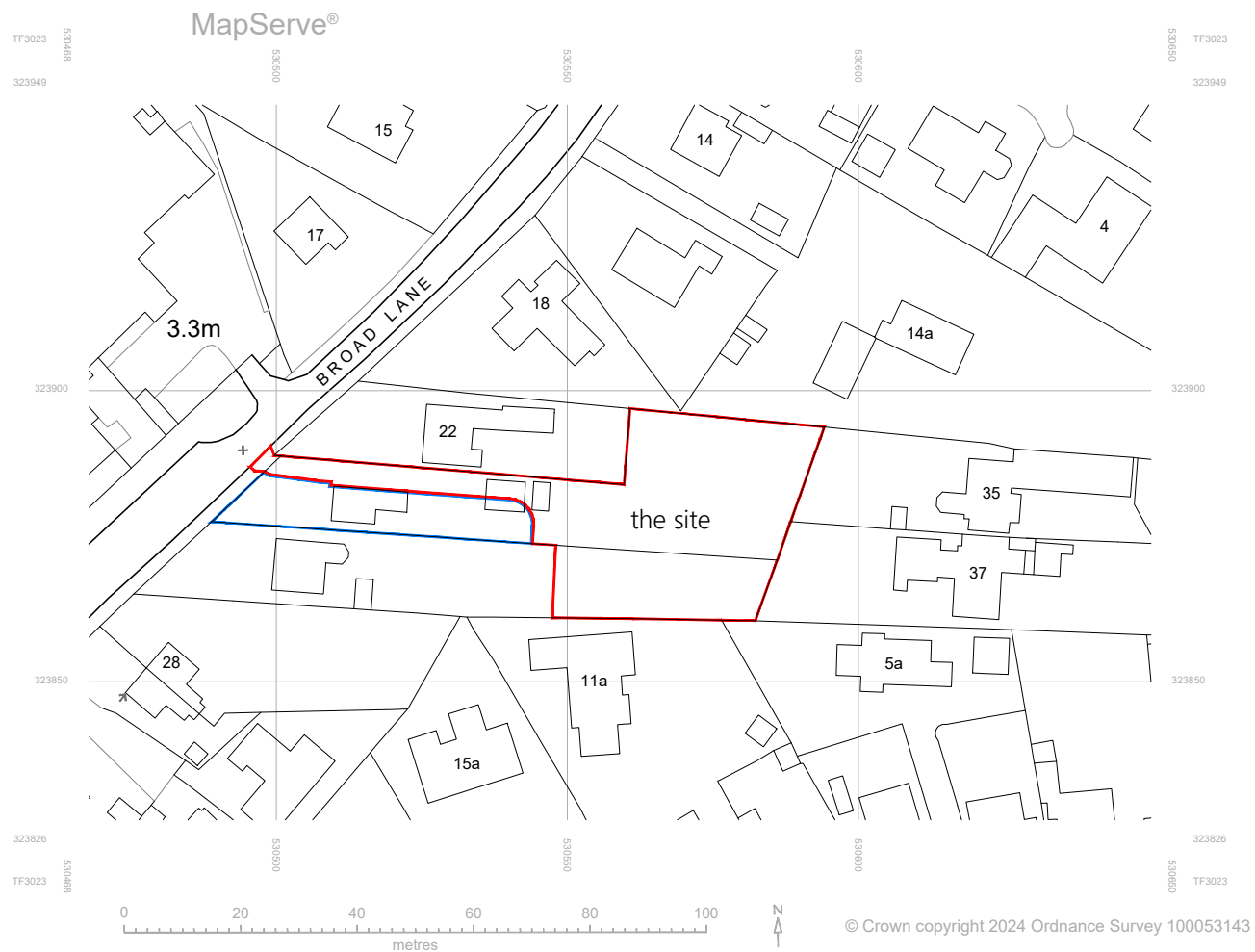
Site location (1:1250)