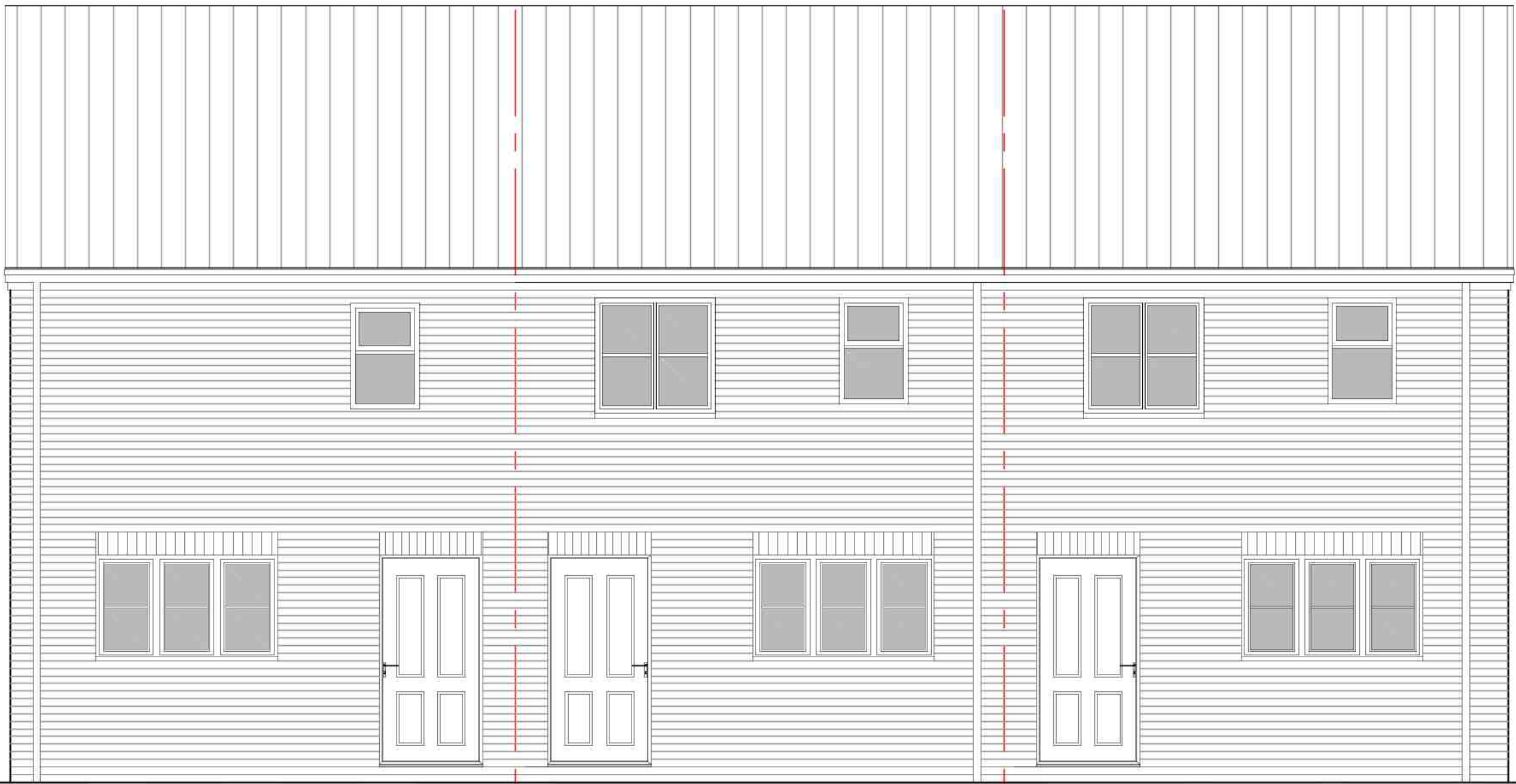
REAR ELEVATIONS SCALE 1:50 2 BEDROOM 3 PERSON - TERRACE

Soldier course. UPVC windows. Colour TBA with LA planning. Stone cills.