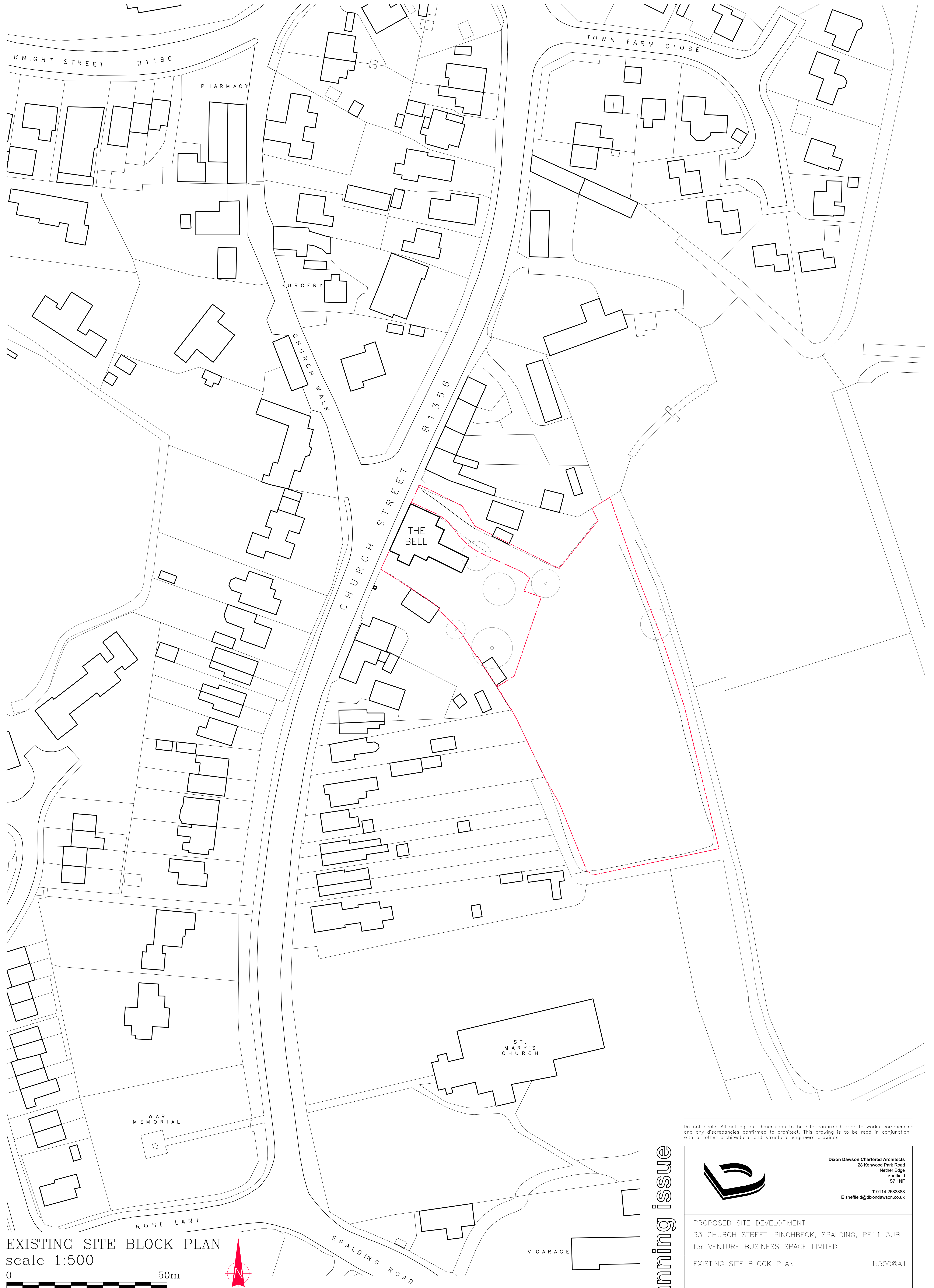
EXISTING SITE BLOCK PLAN scale 1:500