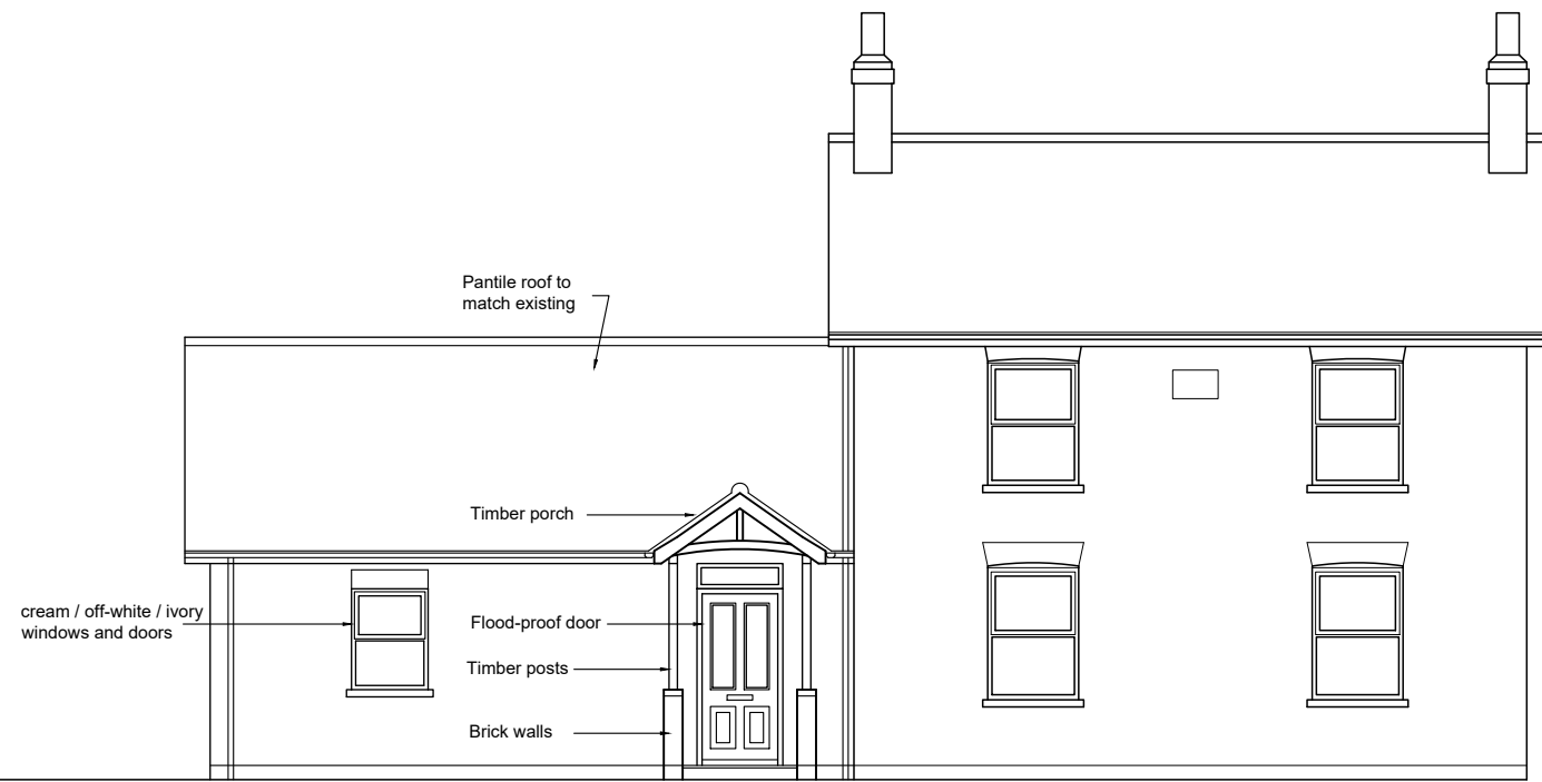
Front Elevation facing North