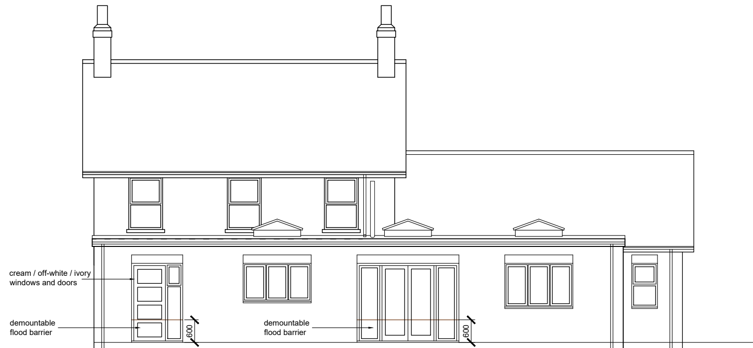
Rear Elevation facing South