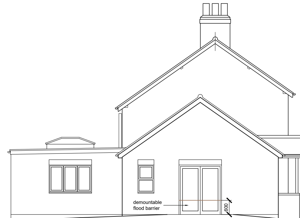
Side Elevation facing East