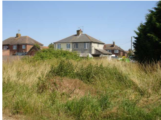
Two storey dwellings to the north (site in foreground)