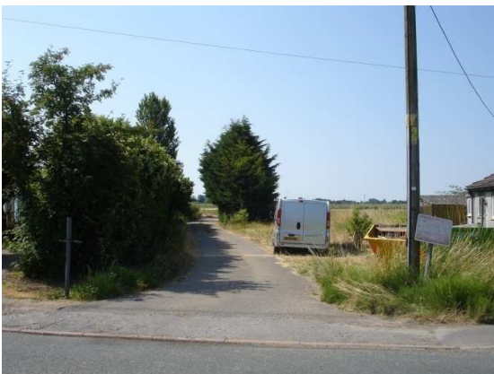
Vehicular access (tarmac) off Main Road

Notwithstanding this, drawing PD01 demonstrates that a safe access is achievable from Main Road by virtue of the existing tarmac roadway. This roadway connects with a further roadway to the side of no. 102, effectively forming a loop. None of the properties (no.s 76-102) have direct access onto Main Road which by its very nature is safer than a row of independent frontage driveways.