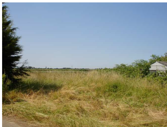
View of site from north (access roadway to the left)

This application is for Outline Planning approval with all matters reserved (matters reserved to be 'access', 'appearance', 'landscaping', 'layout' and 'scale').