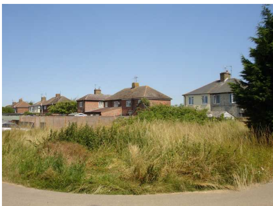
View of site from south east corner

The site falls within the defined settlement limit of the South East Lincolnshire Local Plan 2011-2036, publication version March 2017, Inset Map No. 22.