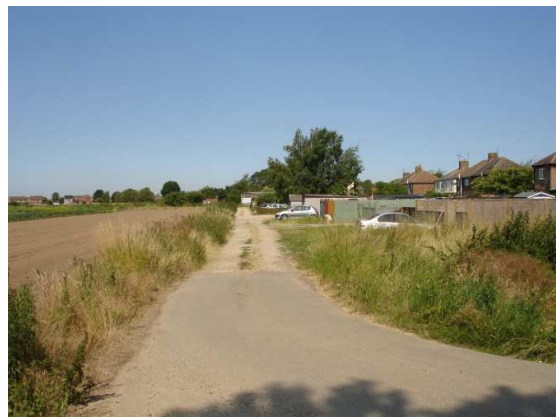
Roadway (gravel) to south serving rear of properties

Drawing PD01 indicates that space is possible for independent driveways/parking provision for both existing no. 76 and the proposed new dwelling, served from the existing tarmac roadway.