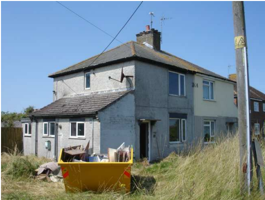
Two storey dwellings to the north (no. 76 & 78)

The immediate context comprises a row of two storey dwellings to the north. The property to the east (no. 74) cannot be seen from the site owing to dense landscape screening.