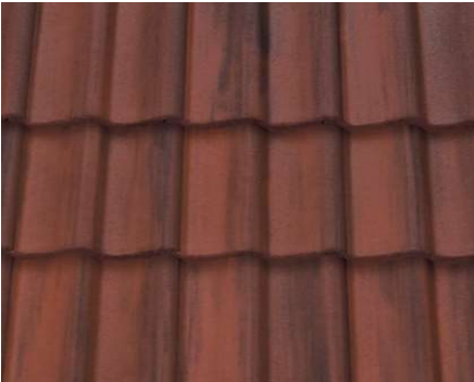
SANDTOFT DOUBLE PANTILE RUSTIC