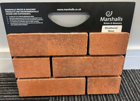
WEATHERED WREN (Detail Brick )