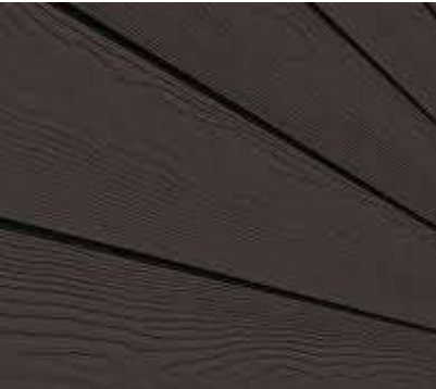
CEDRAL LAP - BLACK C50