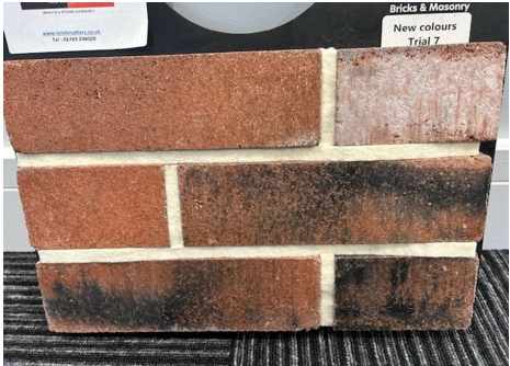
TRAIL 7 BRICK