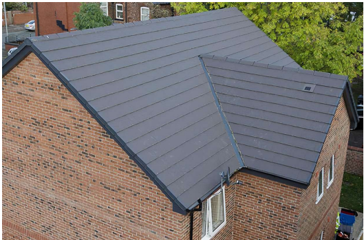
MARLEY EDMERE INTERLOCKING CONCRETE TILE