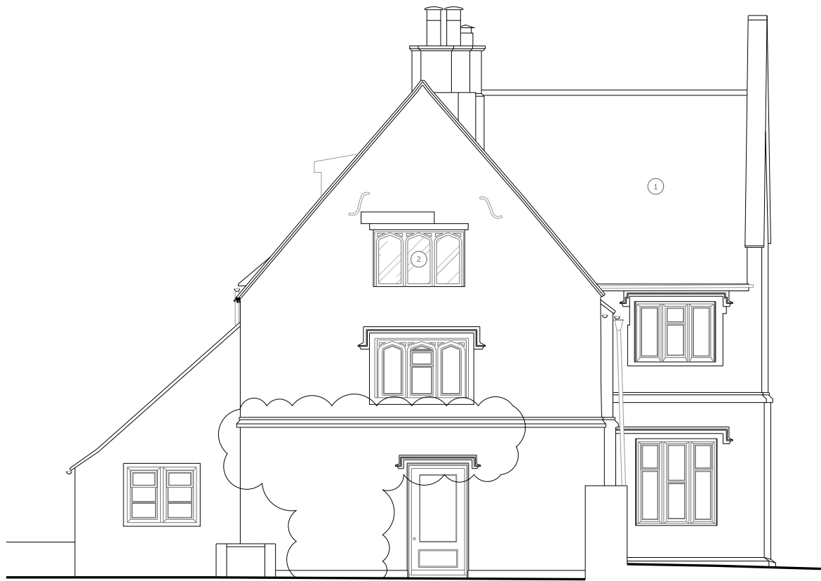
01 | PROPOSED SOUTH ELEVATION