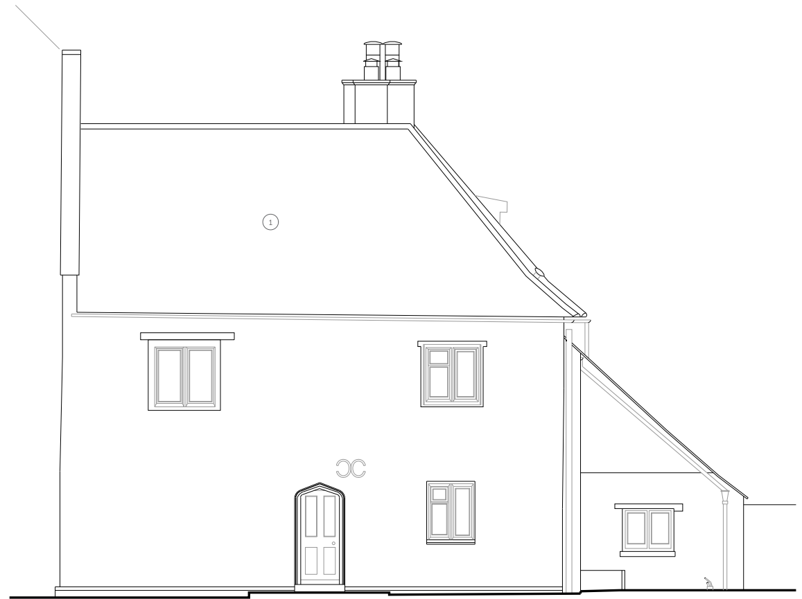
02 | PROPOSED NORTH ELEVATION