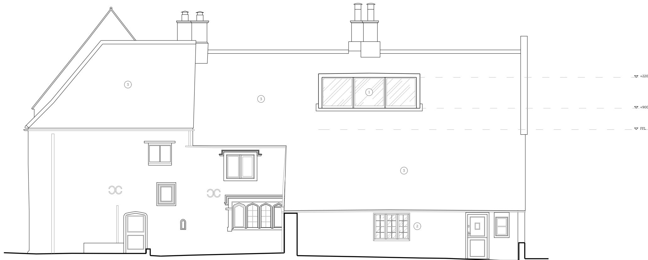
01 PROPOSED WEST ELEVATION Scale 1:100