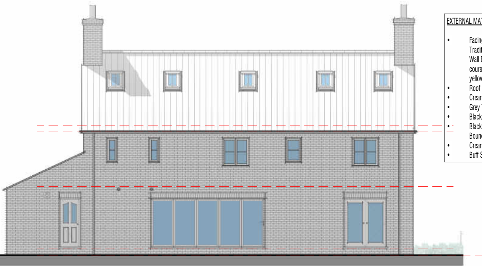
Elevation 03 - Rear 1 : 100