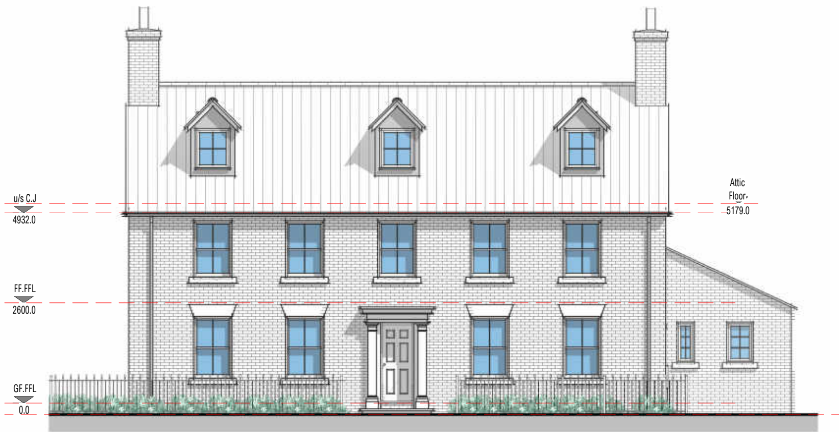
Elevation 01 - Front 1 : 100

CONTRACTOR TO TAKE NOTE: All existing and proposed dimensions are to be checked on site and any discrepancies to be notified immediately. Commencement of works on site will be deemed as all dimensions have been checked. Due to areas of the structure being covered, unexposed or otherwise inaccessible the existing / proposed dimensions / notes / specifications of existing materials are subject to confirmation of site when it is feasible to expose the relevant areas of construction. All material schedules are given in good faith and for pricing purposes only. It is the responsibility of the contractor to check their accuracy before ordering any materials. Remway Design accepts no responsibility for the accuracy of these material schedules.