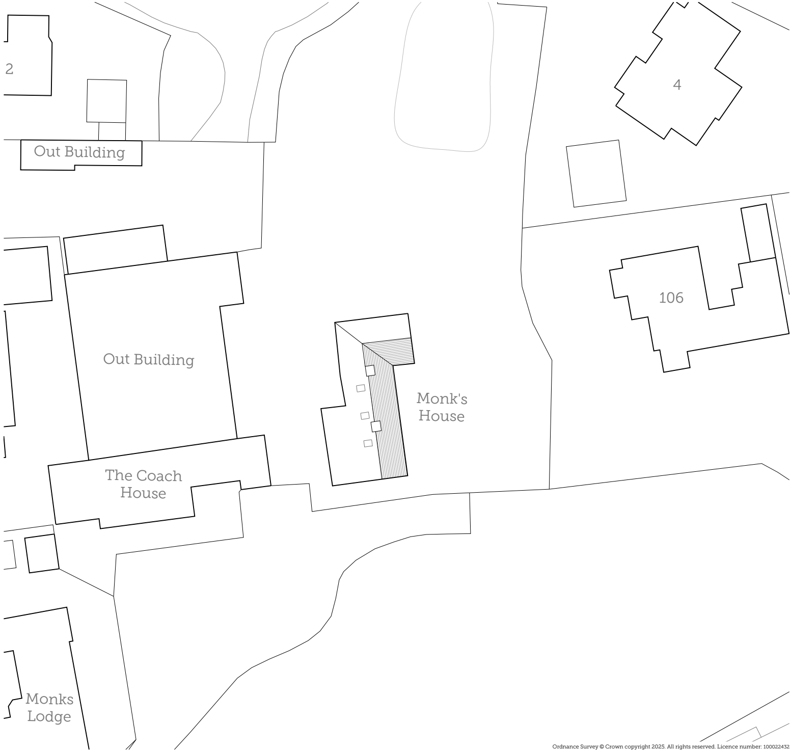
02 | PROPOSED BLOCK PLAN Scale 1:500 @ A3