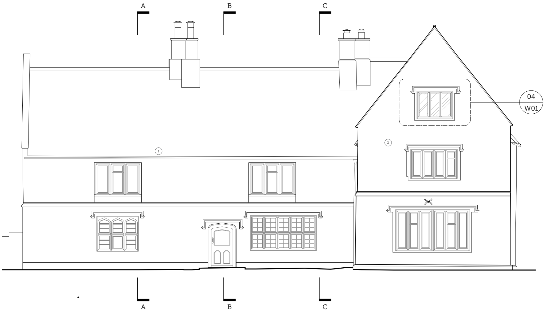
01 | PROPOSED EAST ELEVATION Scale 1:100