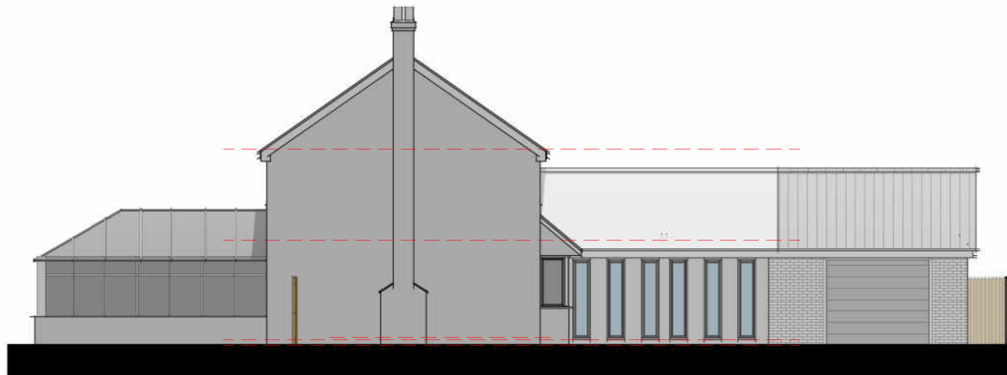
Left Flank Elevation 1 : 100