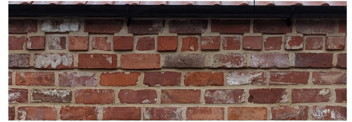
Black UPVC rainwater goods