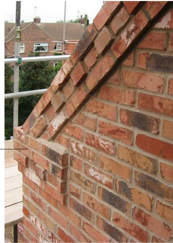
Dentil course detailing