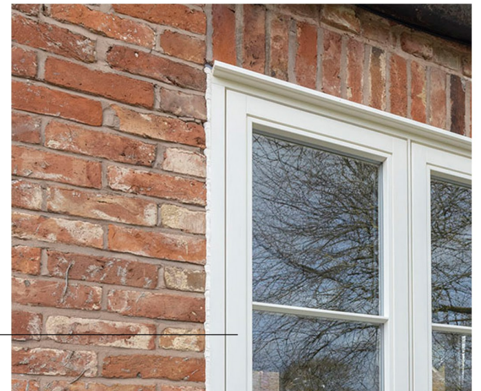
White wooden casement windows