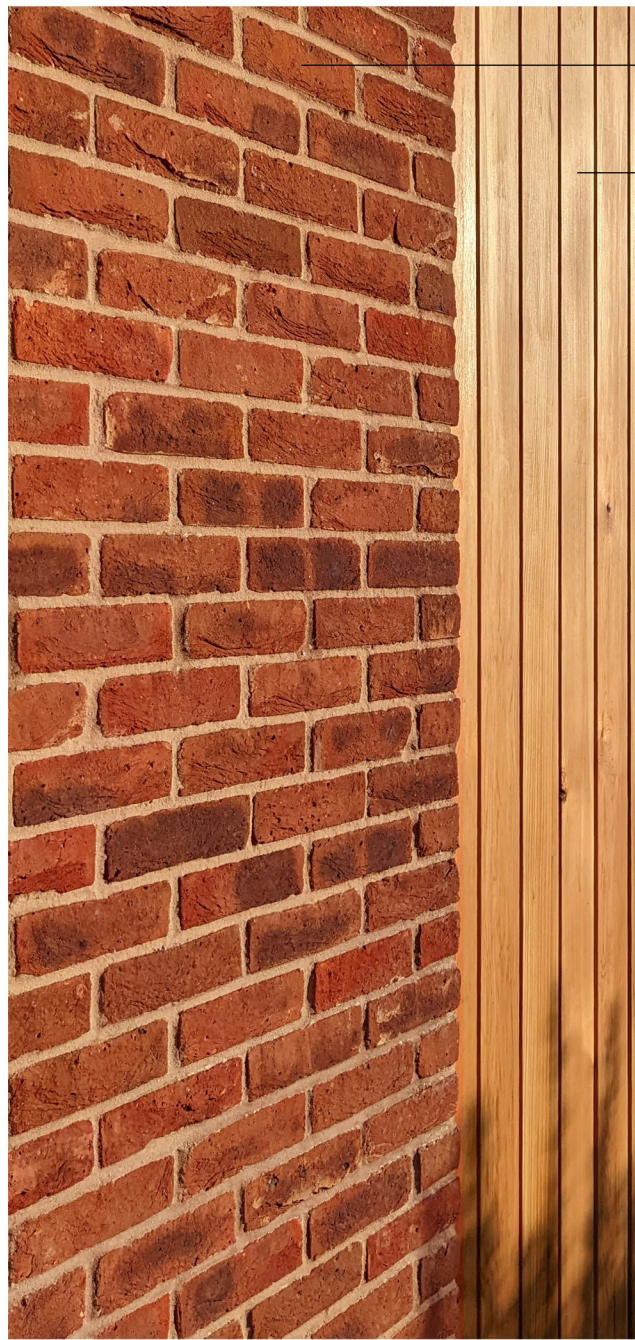
Red facing brickwork