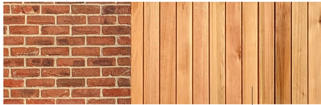
Timber cladding alongside red facing brickwork