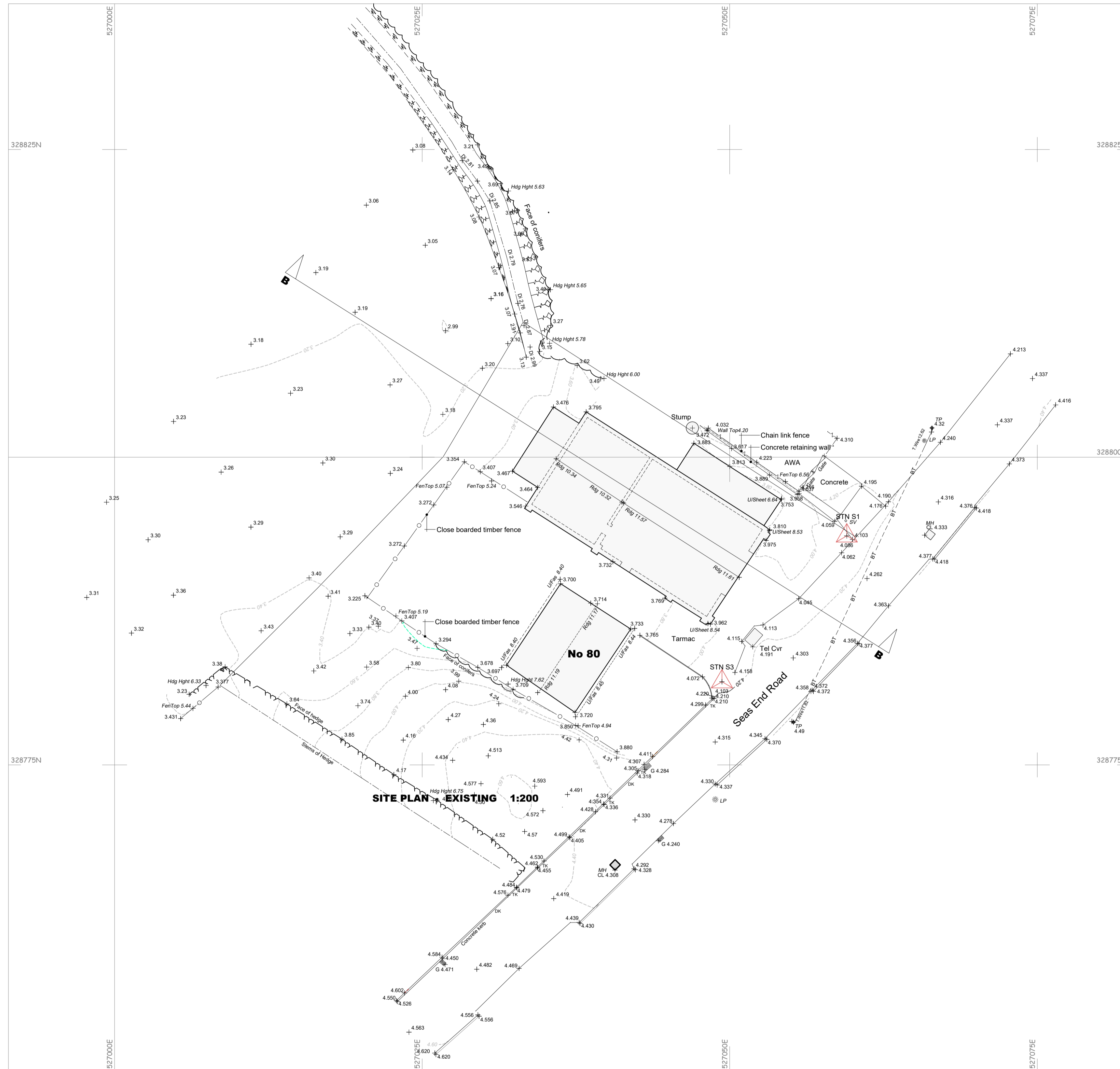
SITE PLAN - EXISTING 1:200