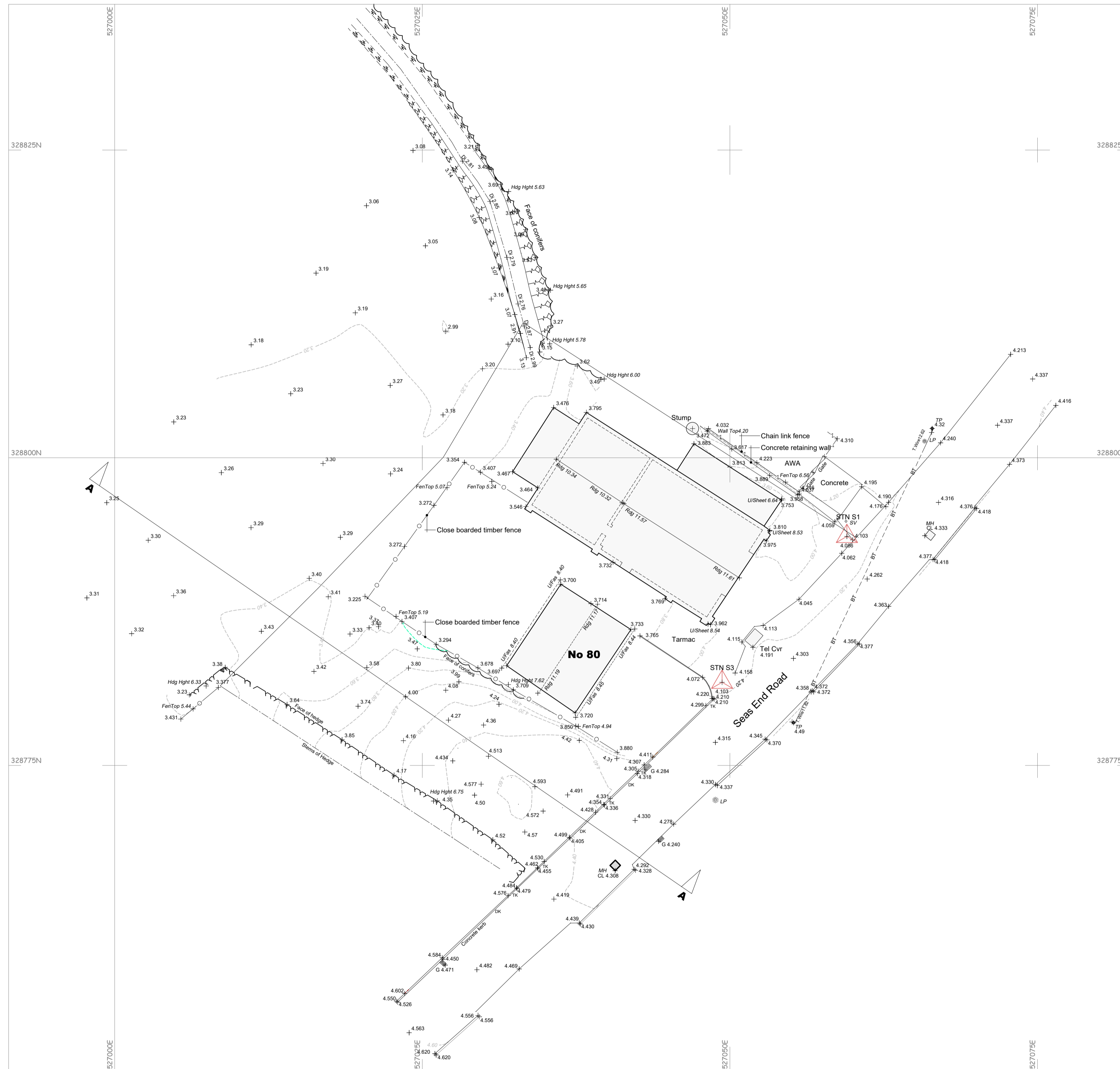
SITE PLAN - EXISTING 1:200