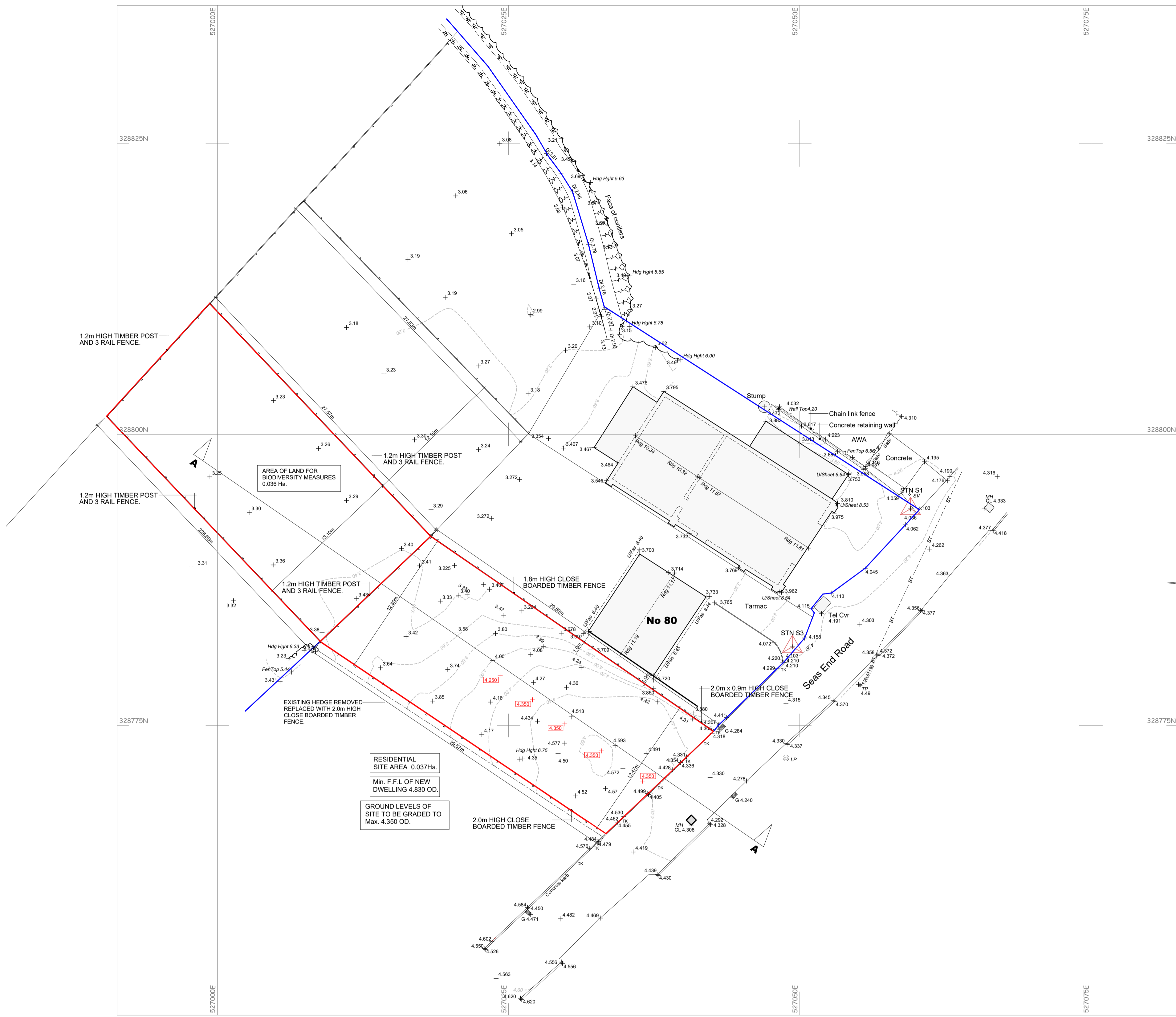
SITE PLAN - PROPOSED 1:200