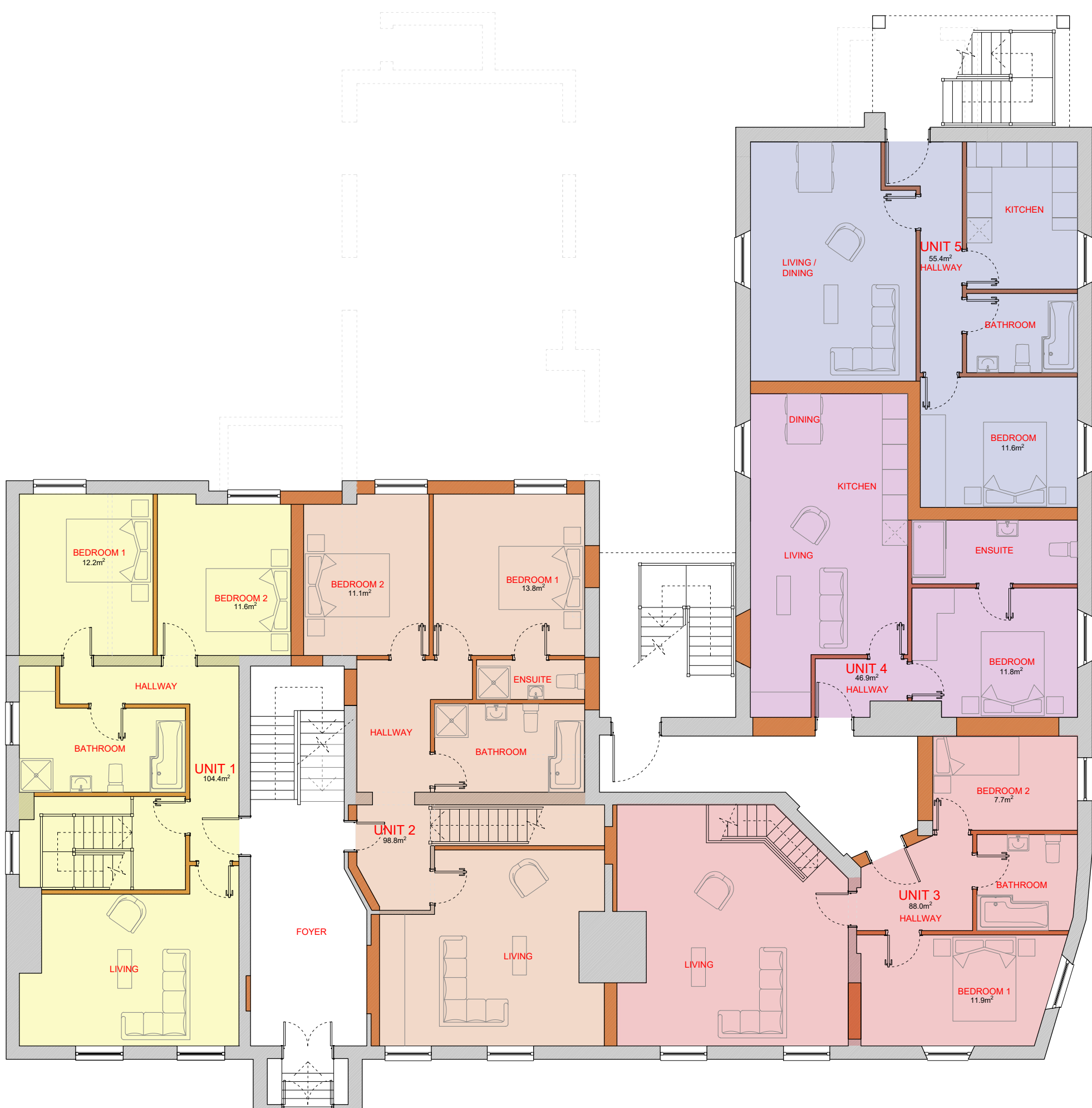
GROUND FLOOR PLAN @ 1:100