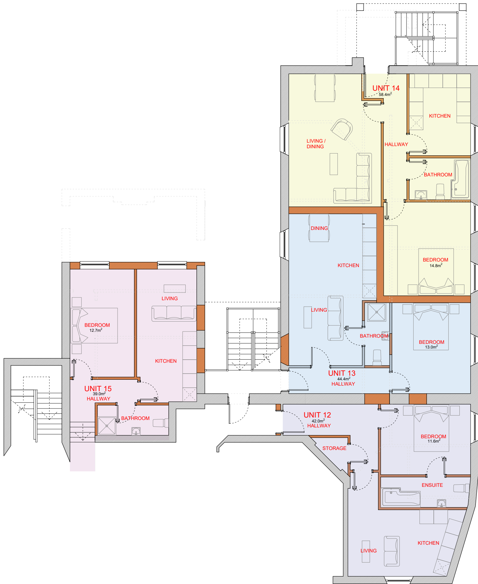
ATTIC PLAN @ 1:100