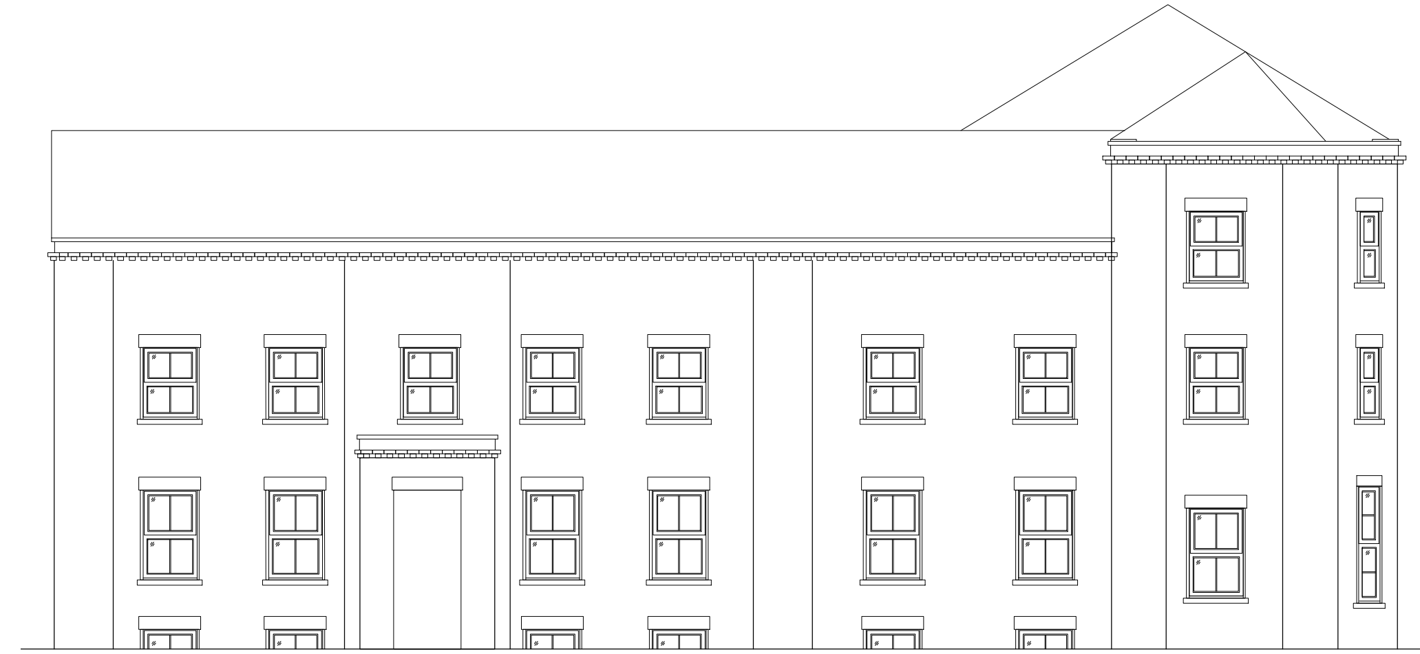
SOUTH ELEVATION @ 1:100