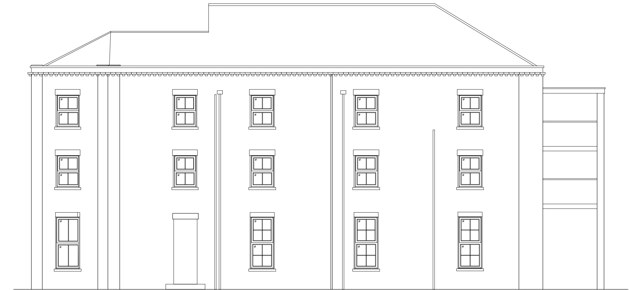
EAST ELEVATION @ 1:100