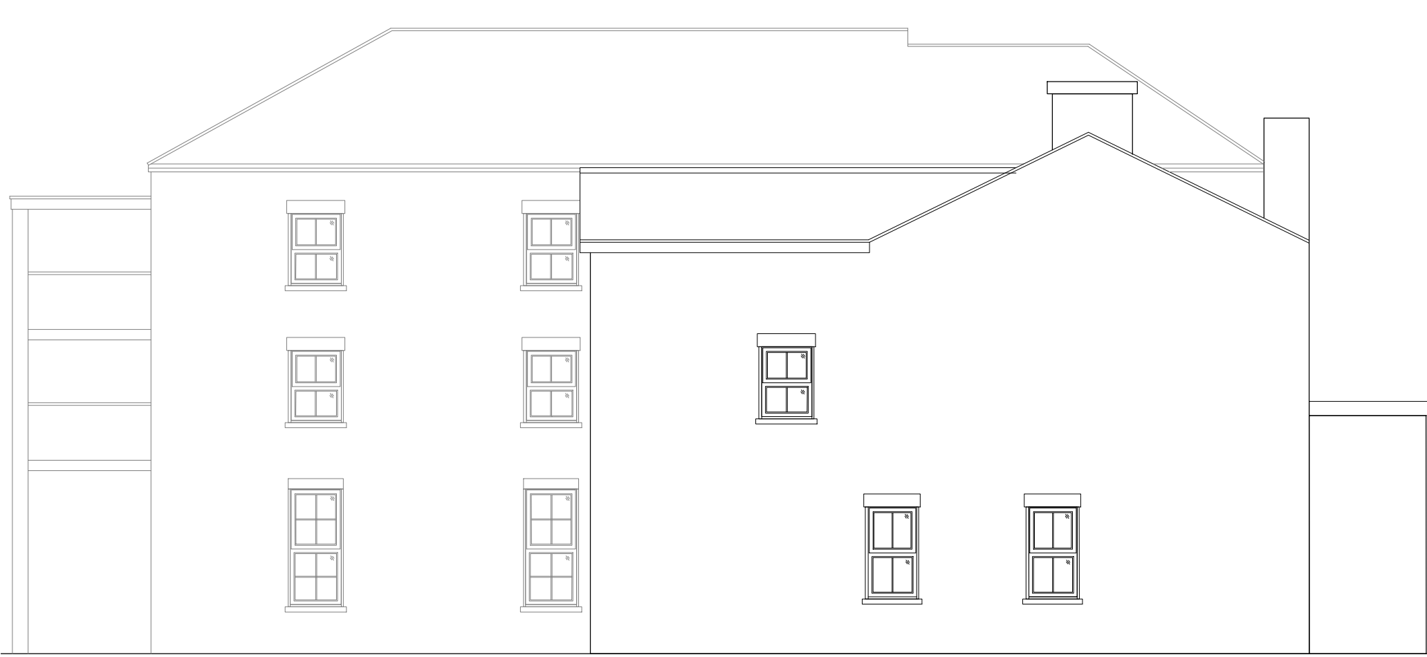
WEST ELEVATION @ 1:100