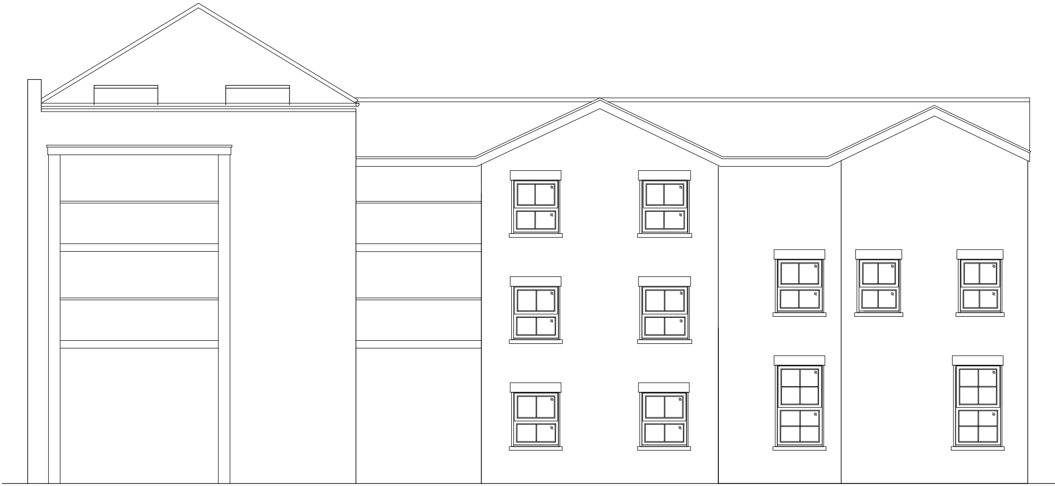
NORTH ELEVATION @ 1:100