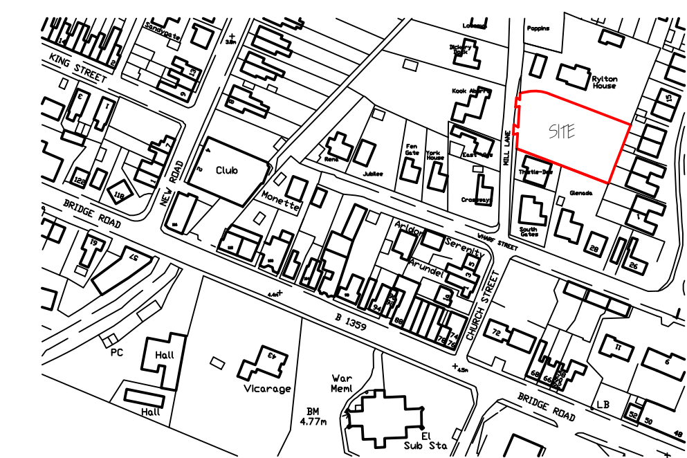
LOCATION PLAN 1/ 2500.