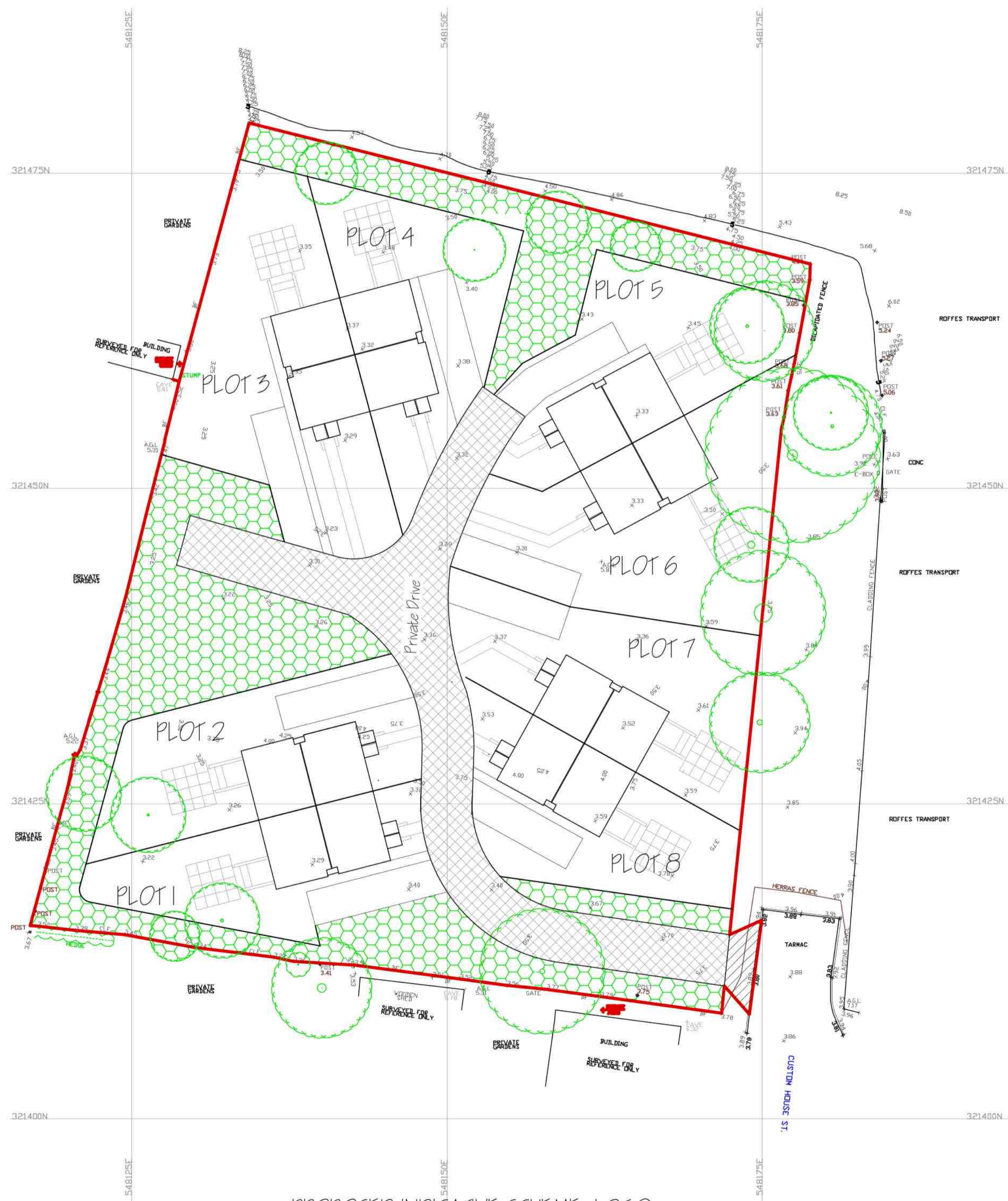
PROPOSED INDICATIVE SCHEME 1:250