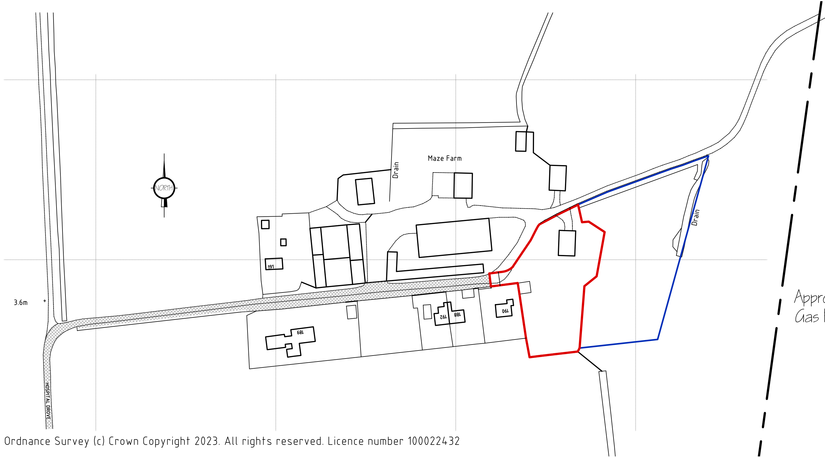
LOCATION PLAN 1:250

Approx Position Of National Gas Transmission Gas Pipe Feeder