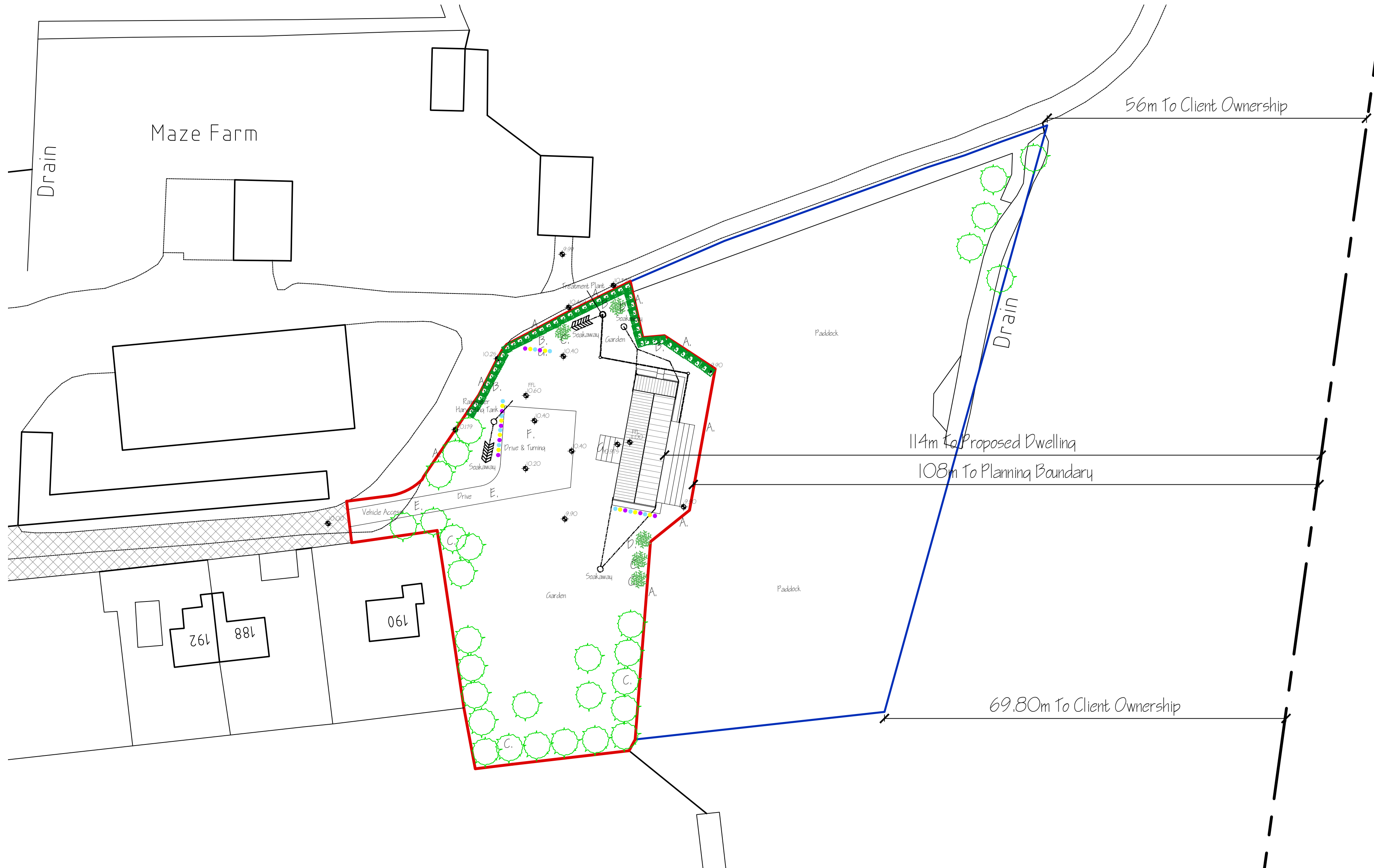
SITE PLAN - PROPOSED 1:500